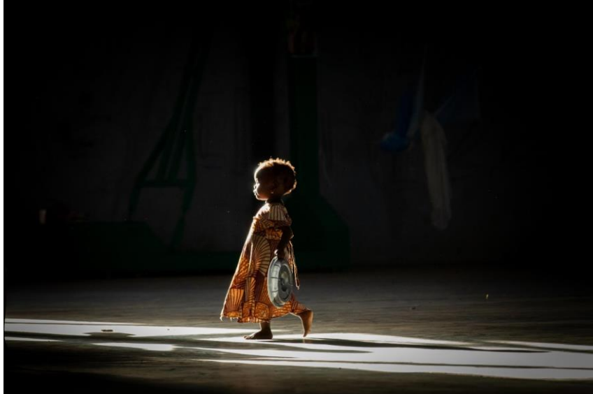
Internally displaced child from Cabo Delgado hosted at the Transit Center in Pemba in June 2021, Cabo Delgado