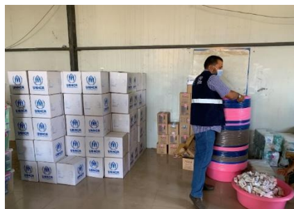
Distribution of CRIs at an IDP settlement in Sidi Al-Sayeh, Tripoli.

Medical assistance continues to be provided by UNHCR's partner IRC. Last week, 264 refugees and asylum-seekers living in the urban community in Tripoli received medical consultations at the CDC. So far this year, IRC has provided 5,325 primary healthcare and 937 mental health consultations in the urban setting; 1,538 in detention centres; and 783 at disembarkation points. In addition, more than 1,600 medical referrals were provided for both public and private secondary health clinics.