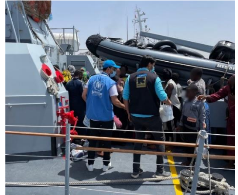
UNHCR and IRC at a disembarkation point in Tripoli.

So far in 2021, a total of 15,690 refugees and migrants have been reported as rescued/intercepted by the Libyan Coast Guard (LCG) and disembarked as of 22 July. Those disembarked were 87 per cent men, 7 per cent women and 6 per cent children. The majority of persons of concern to UNHCR who disembarked in Libya were Sudanese (17 per cent), Eritrean (3 per cent) and Syrian (2 per cent). So far in July, some 989 individuals were disembarked across ports in Tripoli. UNHCR and its medical partner the International Rescue Committee (IRC) remain present at disembarkation points to provide urgent medical assistance and core relief items (CRIs).