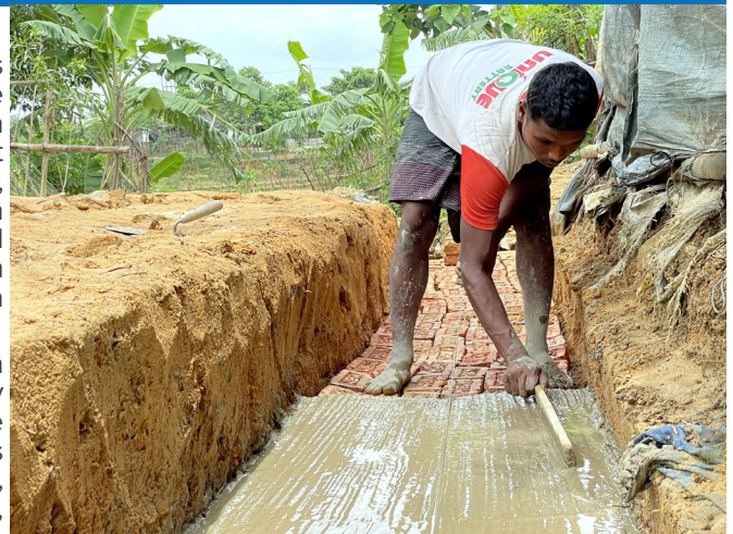
A refugee cements a drainage system as part of community-led project in the camp where he lives.