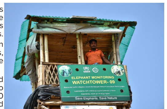
A refugee volunteer and member of the Elephant Response Team on duty in a watch tower.