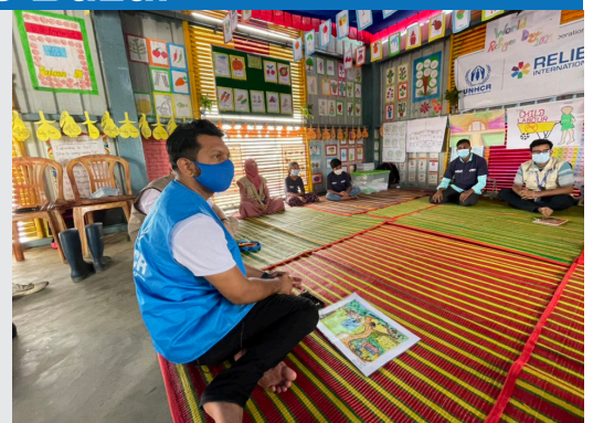
UNHCR Goodwill Ambassador, Tahsan Khan, meeting with children, adolescents, volunteer teachers and other education actors in the camps during his visit.

While in the refugee camps, Tahsan engaged with children, adolescents, refugee volunteers and other actors working in education and gender-based violence prevention. He discussed the preservation of the Rohingya culture with young filmmakers and performed a song with Rohingya musicians. Tahsan met with Government authorities and UNHCR staff who briefed him on the wide range of activities implemented in Cox's Bazar to support refugees and host communities.