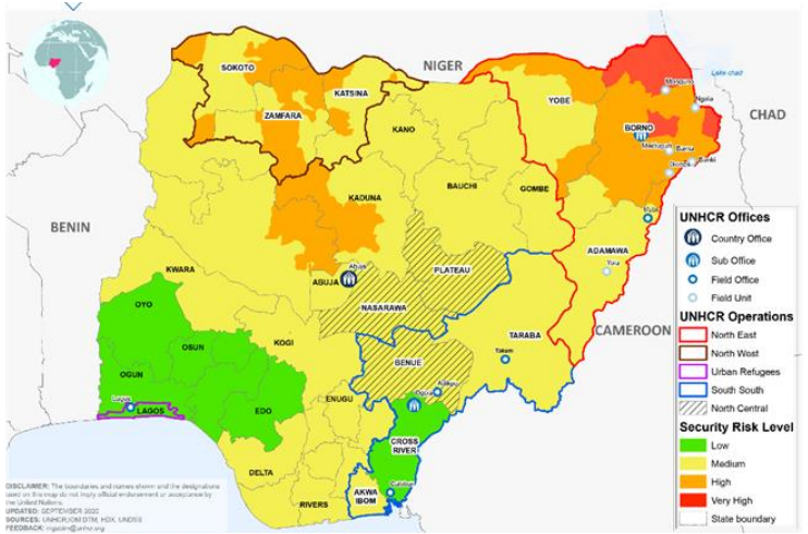
UNHCR is present in Abuja, Maiduguri, Ogoja, Adikpo, Calabar, Takum, Mubi, Lagos, Banki, Gwoza, Bama, Monguno, Ngala, Markudi and Yola