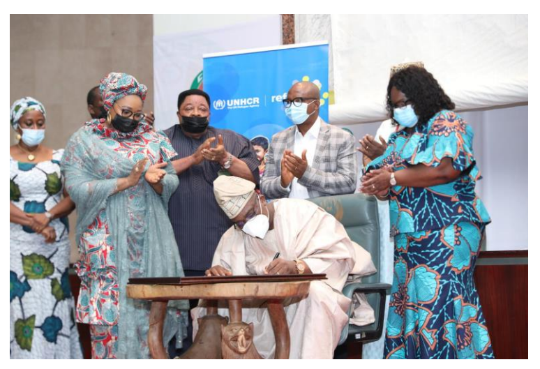
Abuja joins other cities committed to welcoming refugees to integrate and benefit from social and economic opportunities.