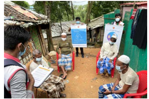
Volunteer Community Health Workers conduct awareness sessions on COVID-19.