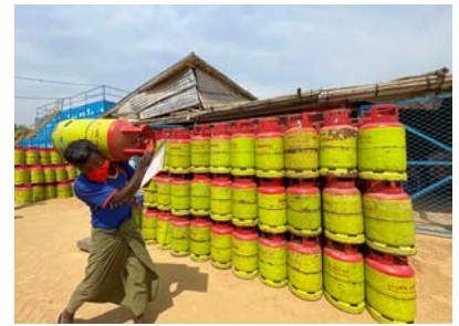
A refugee collects his household's refill of Liquid Petroleum Gas (LPG).