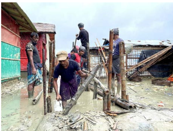
Refugee volunteers repair a bridge following the heavy monsoon rains in July.

Adding to the complexity of the situation, Cox’s Bazar District experienced heavy monsoon rains and strong winds during the week of 27 July. The weather events resulted in the death of eight refugees and 15 Bangladeshis in the host community areas, as confirmed by government officials. 518 villages in Cox’s Bazar District are affected, while almost 25,000 refugees were displaced within the camps. A detailed report about UNHCR’s initial response to flooding and landslides can be found here .