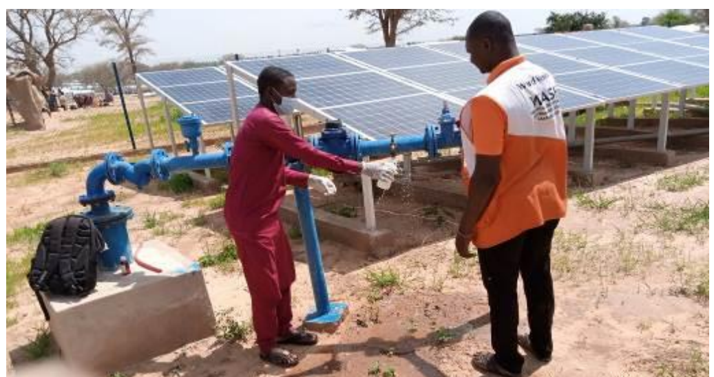
Engineers verifying the quality of water at the water pumping station of Dan Dadji Makaou © / UNHCR.