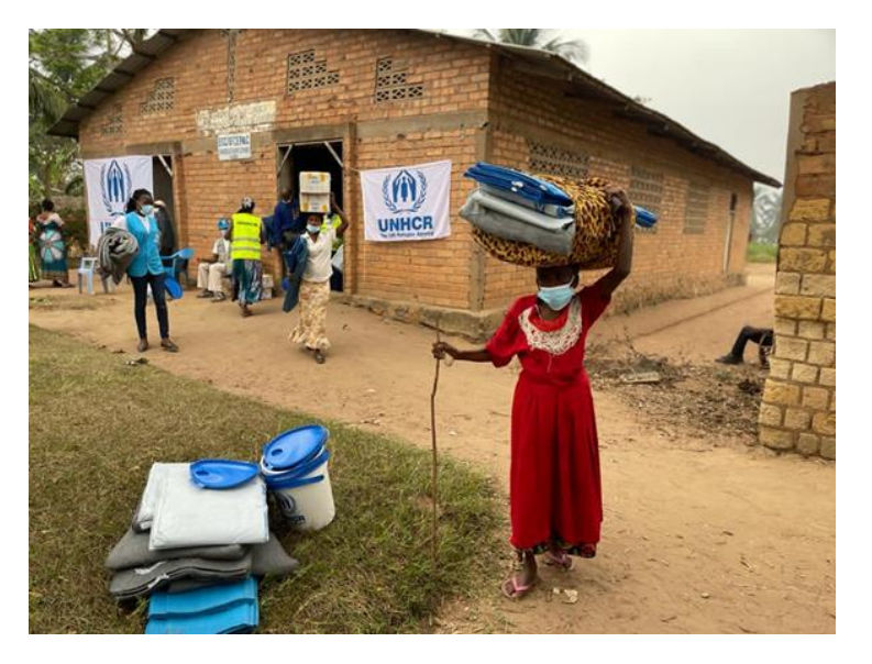
Families affected by heavy rains in Kasai Province receive shelter kits to repair damage.

Requested for the DRC situation Funded 51% $105.1M Gap 49% $99.7M