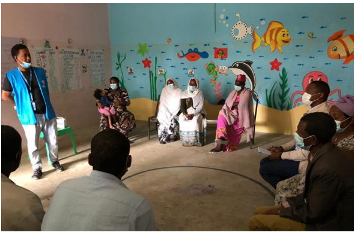
Focus group discussions in Mekelle's IDP site health centre, Tigray region, Ethiopia