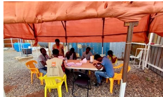
NRC supporting refugees with their applications