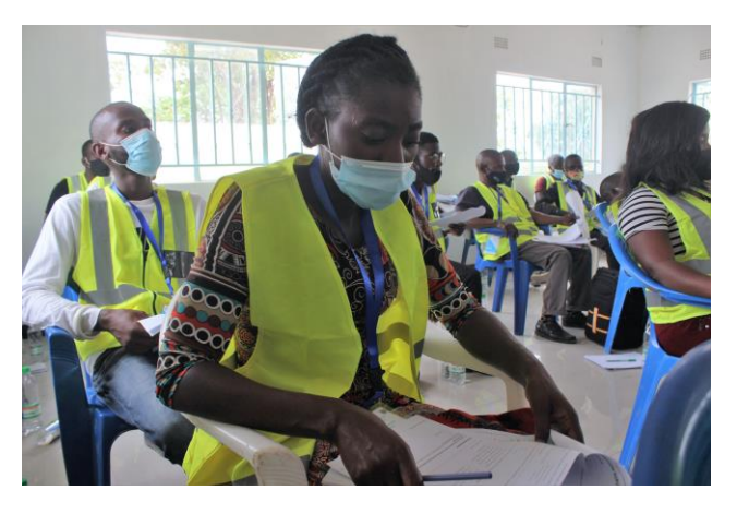
Survey enumerators participate in a training to prepare for the interview phase of Return Intention Survey of the Congolese refugees in Mantapala settlement