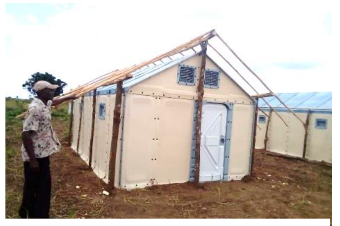
Reinforcing RHUs with wooden posts to increase weather resistance in Bouemba, Republic of the Congo.