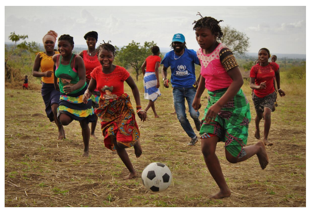
Displaced and host community girls play football in Cabo Delgado, Mozambique, in a game organized by UNHCR.

COVID-19 : Vaccination rollout across the region, with persons of concern included in vaccination plans and receiving doses.