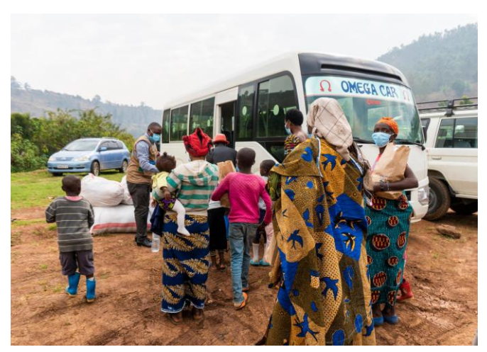
A group of Rwandan refugees who requested voluntary repatriation from the Democratic Republic of the Congo board the bus which will bring them to Gisenyi, in Rwanda.

Cash assistance: UNHCR and the World Food Programme reached 30,937 South Sudanese refugees through a joint cash-for-food distribution in the three sites in Haut-Uele and Ituri Provinces, to meet their most urgent needs.