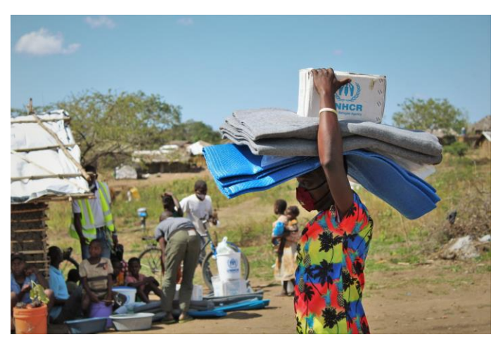
Distribution of core relief items to displaced and host communities in Cabo Delgado, Mozambique.

identified as the major challenges in Pemba, with existing services understaffed, functioning at reduced capacity and overwhelmed due to the influx of IDPs. Additional partners and government support are required to scale-up specialized GBV services.