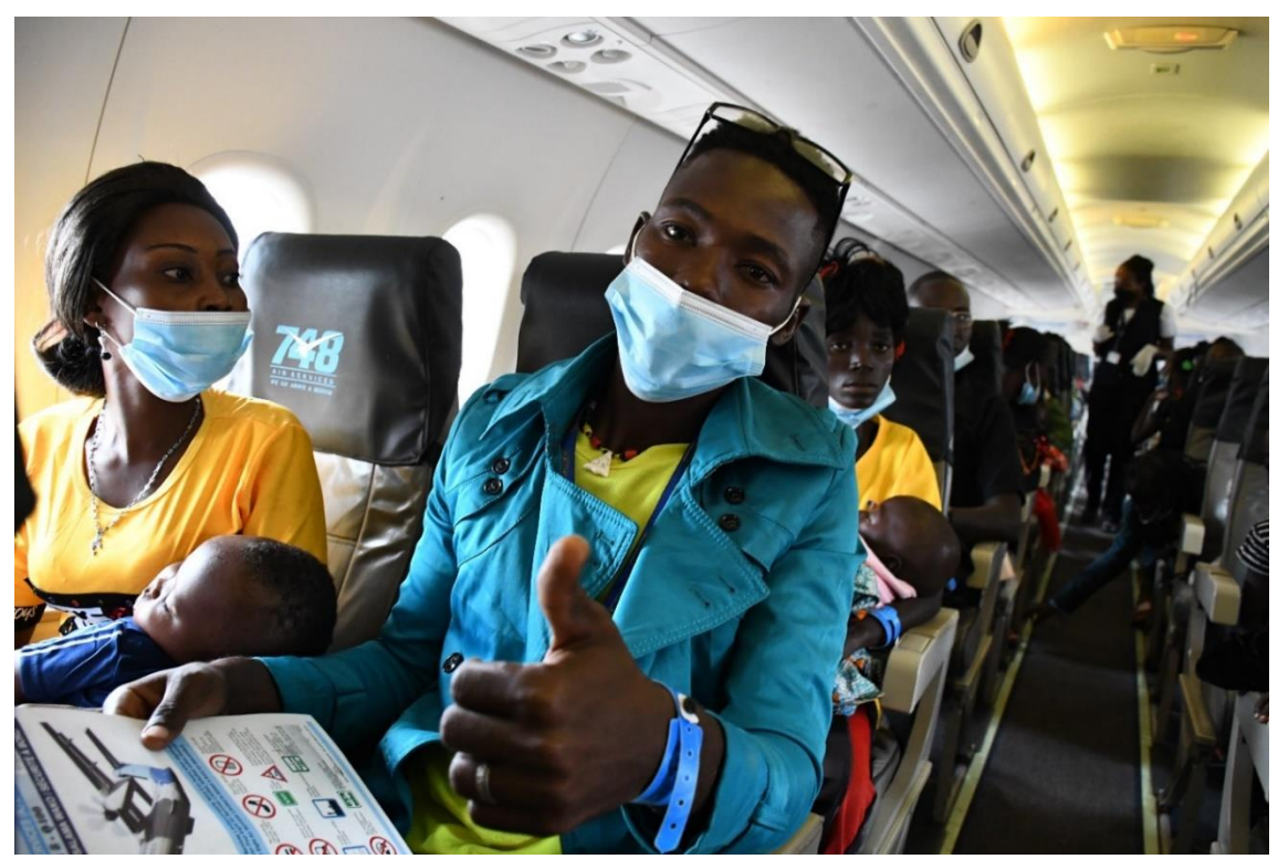
A CAR refugee family returns home via the UN humanitarian flight from Gbadolite to Bangui, after eight years living in DRC's Inke camp, North Ubangi Province

In November 16 15,756 refugees have benefitted from a WFP cash distribution in Bosobolo Territory, North Ubangi province.