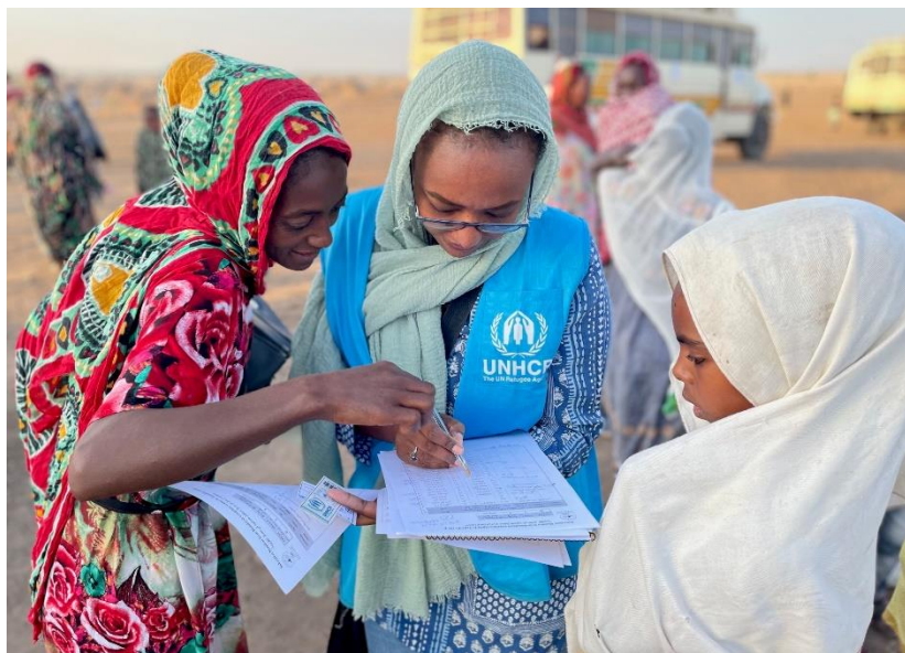
Final checks before refugees board a bus to Tunaydbah camp

On 22 November, UNHCR, Sudan's Commission for Refugees (COR) and partners resumed the relocation of 129 Ethiopian refugees from Hamdayet Transit Centre to Tunaydbah camp. This was the first movement from Hamdayet since the exercise was temporarily put on hold earlier this year. A large number who signed up for relocation were male, single-headed households and most indicated they were relocating to be closer to family and friends already in Tunaydbah. Eight (8) buses and four (4) trucks were leased to facilitate the relocation of refugees and their belongings. Several partners involved in the relocation provided various types of assistance, including hot meals, biscuits and water, face masks and hand sanitizers. A medical escort accompanied the convoy to Tunaydbah, where refugees were received by UNHCR and partners and assigned shelters. Registration for the second convoy, which is planned for 25 November, is ongoing.