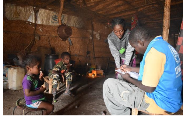
UNHCR visits a refugee household in preparation for the relocation exercise