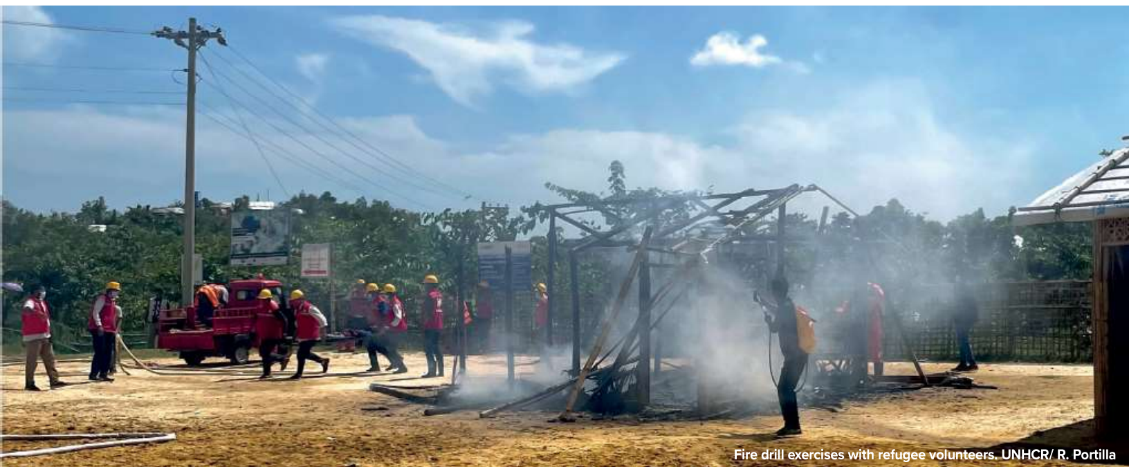
Fire drill exercises with refugee volunteers.