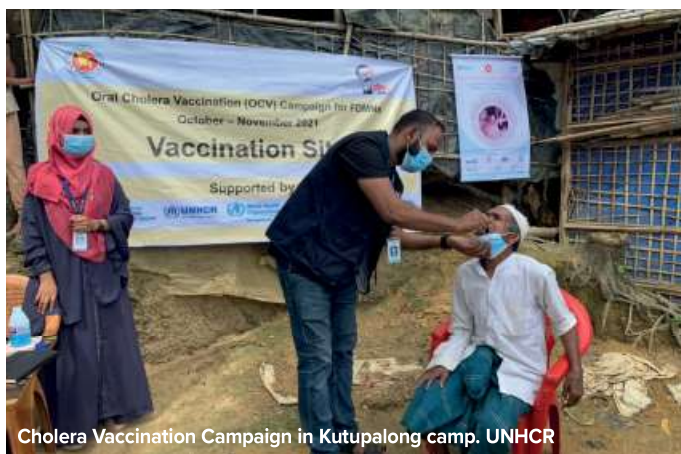
Cholera Vaccination Campaign in Kutupalong camp.

- 735,907 refugees and members of the local communities were vaccinated against cholera, following the Oral Cholera Vaccination Campaign for those age one (1) year and above that started in October.