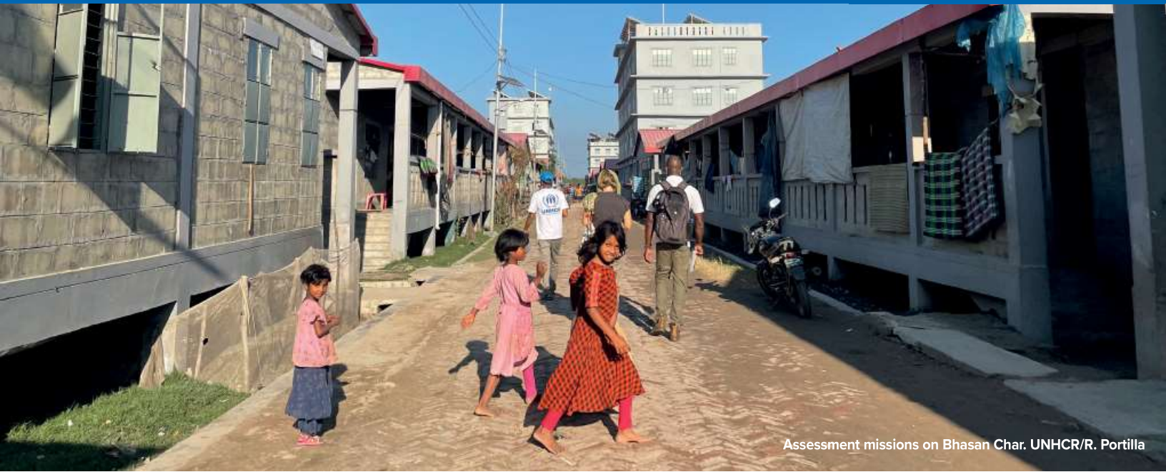
Assessment missions on Bhasan Char.

UNHCR and partners have set up the COVID-19 vaccination campaign targeting Rohingya refugees aged 18 and above, in line with the Government's vaccination plan. The target population is 390,000 persons, including all adults, and those over 55 years of age who might not have been vaccinated in the first round in August/September when 36,000 were immunized. Community health workers supported the immunization drive by conducting over 30,000 awareness sessions.