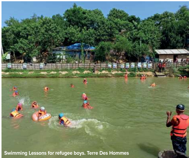
Swimming Lessons for refugee boys. Terre Des Hommes

- 60 Rohingya adolescent boys successfully completed swimming training, as part of drowning prevention activities, while including girls will require additional awareness raising. Fatal drowning incidents among children under five in the camps and host communities are an important concern.