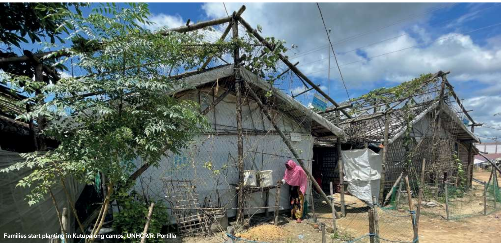
Families start planting in Kutupalong camps.