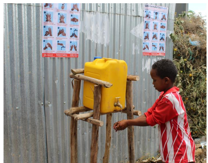
A Somali refugee child washes his hands as part of the COVID-19 prevention measures UNHCR and partners continue to reinforce in refugee camps across Ethiopia.