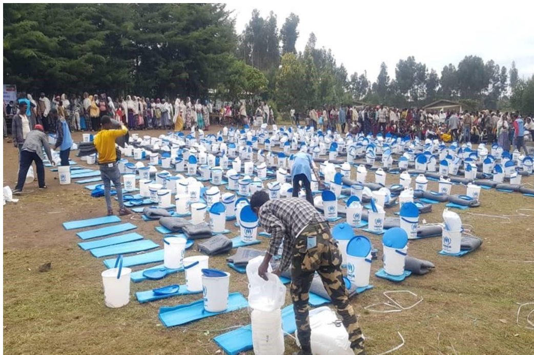
Over the past two months, UNHCR and its partners distributed life-saving aid items to some 90,000 internally displaced people in the Afar, Amhara and Tigray Regions.