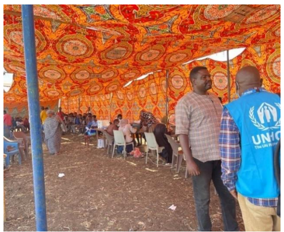
The newly relocated refugees are being registered at Um Rakuba

Newly arrived refugees and asylum seekers relocated: Following the conclusion of the relocation exercise from Hamdayet Transit Center last week, an additional 475 refugees and asylum seekers who had recently crossed the border from Ethiopia into Sudan, were transferred to Tunaydbah (241), Um Rakuba (207) and Babikri (27). UNHCR, Sudan's Commission for Refugees (COR) and partners, including ALIGHT, DRC, IRC, NRC and Plan International provided the newly relocated with shelters and assistance. COOPI, Muslim Aid and CARE distributed hygiene kits, hot meals and water among the refugees and asylum seekers. The group is currently being individually registered and receiving life-saving supplies at registration and distribution centres in the three locations. Since November 2020, a total of 47,165