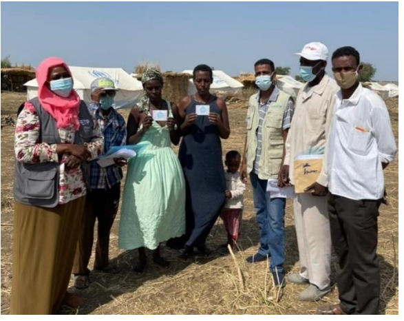
Vaccinated asylum seekers receiving their COVID-19 vaccination card in Babikri

As of 26 December, 76 new arrivals were reported in Hamdayet Transit Centre, while 33 new arrivals were recorded in Taya border entry point.