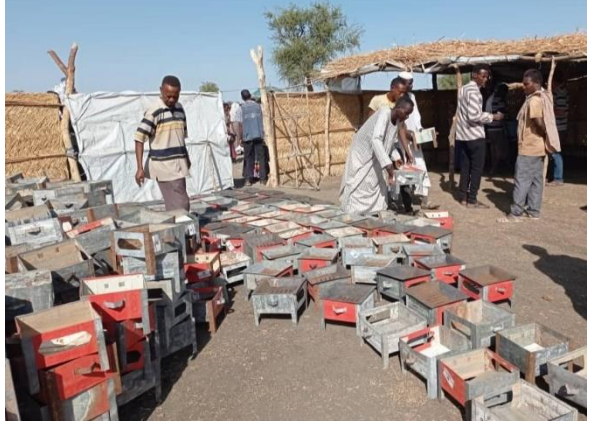
The distribution of emergency stoves in Babikri