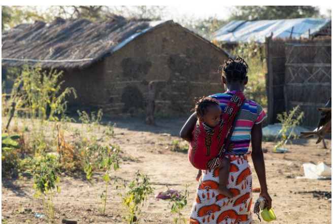
Displaced girl with a baby in Ngalane IDP site, Metuge District, Cabo Delgado

183 trained community volunteers providing awareness and referrals to GBV services