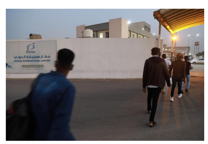
On 4 November 2021, 172 asylum-seekers were evacuated from Libya to Niger in the context of the Emergency Transit Mechanism after more than a year of suspension

Committee against Trafficking in Persons and Related Practice (Comité National de Lutte contre la Traite des Personnes et des Pratiques Assimilées, CNLTPPA). In Mali still, the members of the Protection Cluster were trained on trafficking in persons and smuggling with a view to enhance referrals in the context of internal displacement. In addition, UNHCR Mali briefed the UN Special Rapporteur on contemporary forms of slavery, including its causes and consequences, on descentbased slavery and its links to forced displacement. In Senegal, UNHCR and 13 UN entities joined forces under the leadership of the Government to develop a national strategy on youth taking into consideration the issue of mixed movements. At the regional level, IOM and UNHCR committed through a Joint Agreement signed in February 2021 operationalize in the region the updated IOM-UNHCR Framework Document on developing standard operating procedures to facilitate the identification and protection of victims of trafficking (June 2020), seeking to strengthen cooperation between the two organisations with respect to the identification, referral, protection and assistance of victims and survivors of trafficking. The updated Framework was subsequently introduced to all IOM and UNHCR colleagues in the region during a joint webinar held on 18 February 2021.