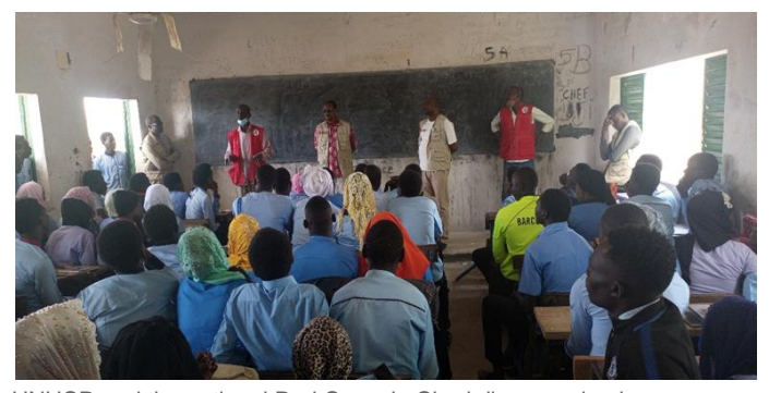
UNHCR and the national Red Cross in Chad discuss mixed movements with communities

UNHCR supported States in the region with the establishment and reinforcement of quality and accessible national protection frameworks and systems. In Burkina Faso, UNHCR advocated for the reform of the asylum law in line with relevant standards and supported the adoption in January 2022 of secondary legislation laying down the role, composition and working modalities of the National Commission for Refugees. In Côte d'Ivoire, UNHCR provided legal and technical assistance to the authorities with the introduction to Parliament of a draft bill expected to become the first legislative framework regulating asylum in the country. In Gabon, UNHCR and the UN Office on Drugs and Crime (UNODC) advised the Ministry of Justice in the context of the reform of the Criminal Code to decriminalise the rescue of and assistance to asylum-seekers and migrants at for sea humanitarian reasons. In Guinea. UNHCR supported the Government with the development of secondary legislation facilitating the implementation of the 2018 asylum law.