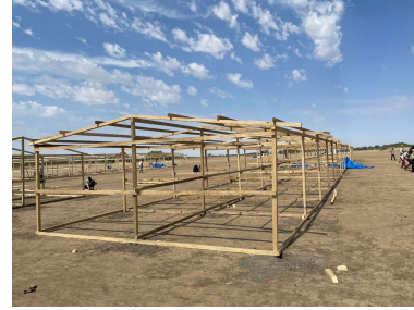
Wooden framework of transit shelters.