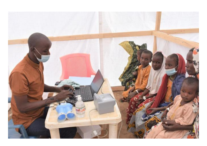
Chad – Individual basic registration of refugees in Guilmey site on 11 January 2022.