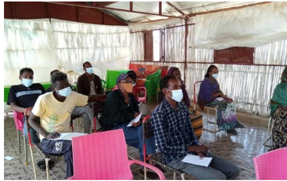
Meeting with community leaders in Um Rakuba