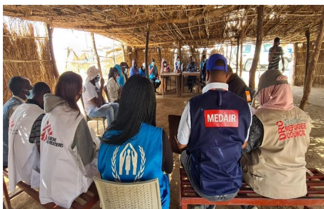
COR, UNHCR and partners convene a brief meeting at Tunaydbah ahead of the joint needs assessment.

UNHCR and partners came together to provide assistance and support to 36 families affected in a fire in Tunaydbah camp on 4 February which resulted in one casualty. Refugee volunteers recently trained in fire-safety and response were quickly mobilized and provided psychological first aid. A joint needs assessment was coordinated by UNHCR, Sudan's Commission for Refugees (COR) and partners following the blaze. MSF provided medical assistance while NRC cleared the ground, pitched tents and distributed core-relief items (CRIs) to the fire-affected families. Muslim Aid provided hot meals on the day of the fire prior to the provision of one-month food rations by WFP. UNICEF also distributed shoes, t-shirts and scarves to children. UNHCR issued fire-affected families with new photo slips. Investigations are underway to determine the exact cause of the fire. Fire-preparedness and community mobilization remains a priority.