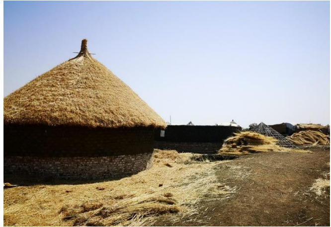
Tukuls provide refugees with more security and protection