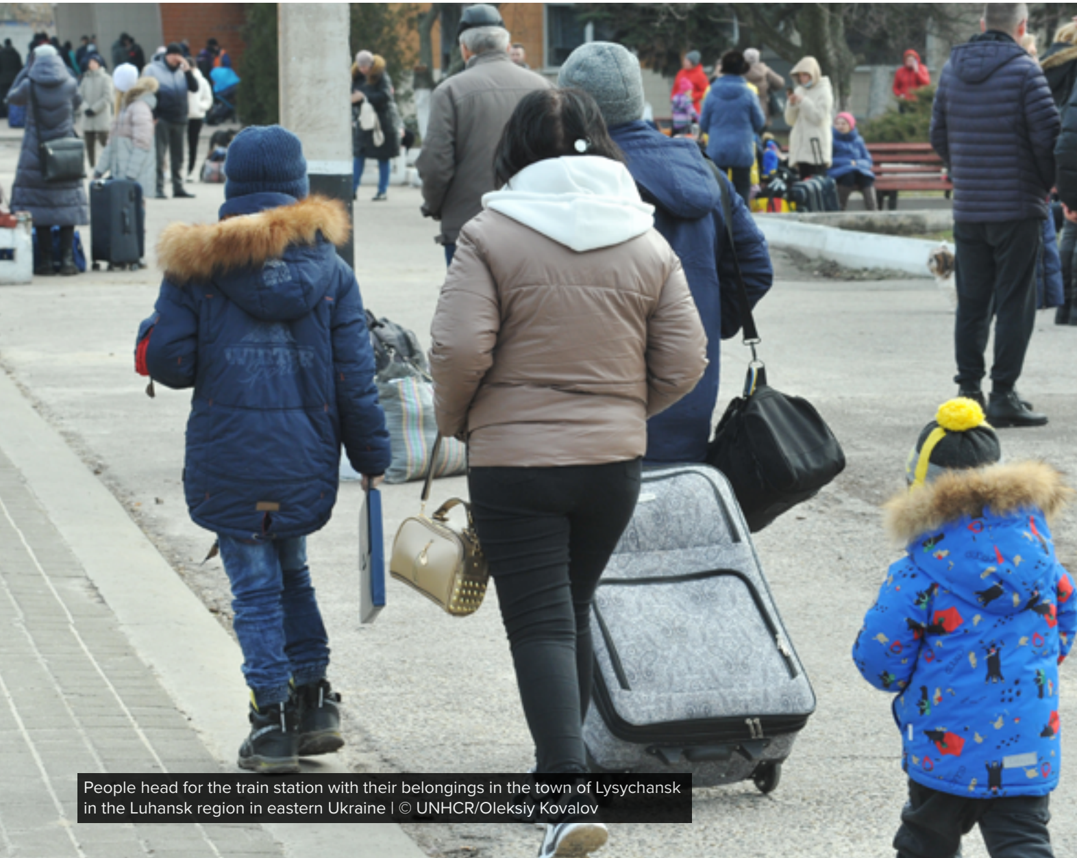
People head for the train station with their belongings in the town of Lysychansk in the Luhansk region in eastern Ukraine