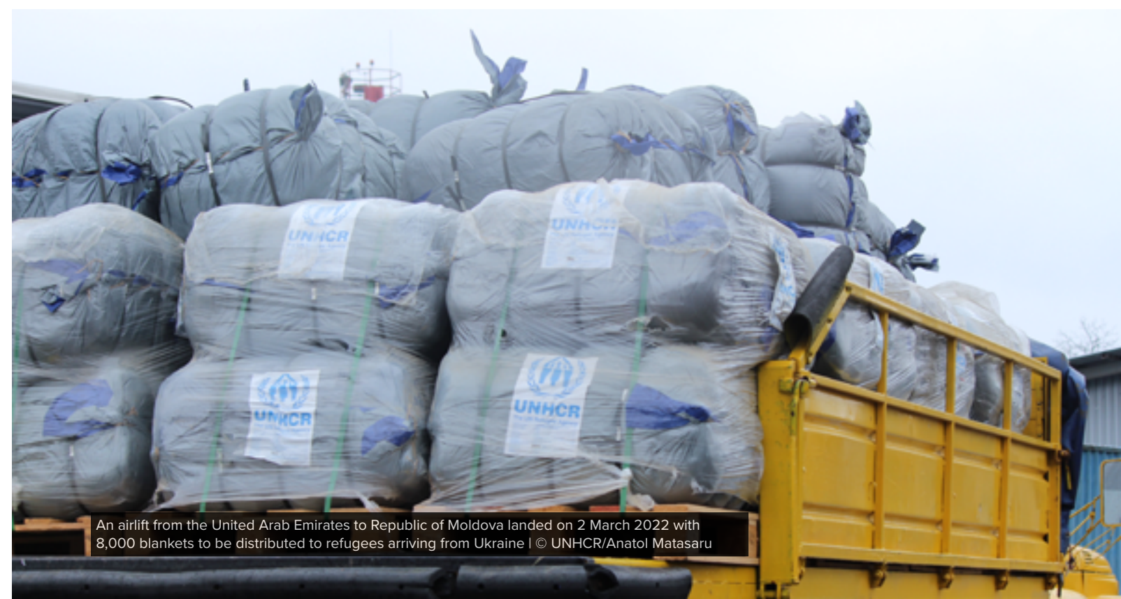
An airlift from the United Arab Emirates to Republic of Moldova landed on 2 March 2022 with 8,000 blankets to be distributed to refugees arriving from Ukraine

UNHCR is assessing the feasibility of distributing emergency cash through bank cards to new arrivals in various countries including Poland and the Republic of Moldova . Unrestricted cash programmes are also planned in other affected frontline countries. In the Republic of Moldova , UNHCR is working with partners to start small-scale emergency cash distributions in a temporary placement centre, focusing on specific cases initially while the mechanism for larger-scale assistance is set up. To this end, UNHCR is in discussions with financial service providers and relevant authorities on establishing an electronic cash delivery system. A Cash Working Group, co-chaired by the Ministry of Health, Labour and Social Protection and UNHCR, has been set up to help coordinate the delivery of cash assistance.