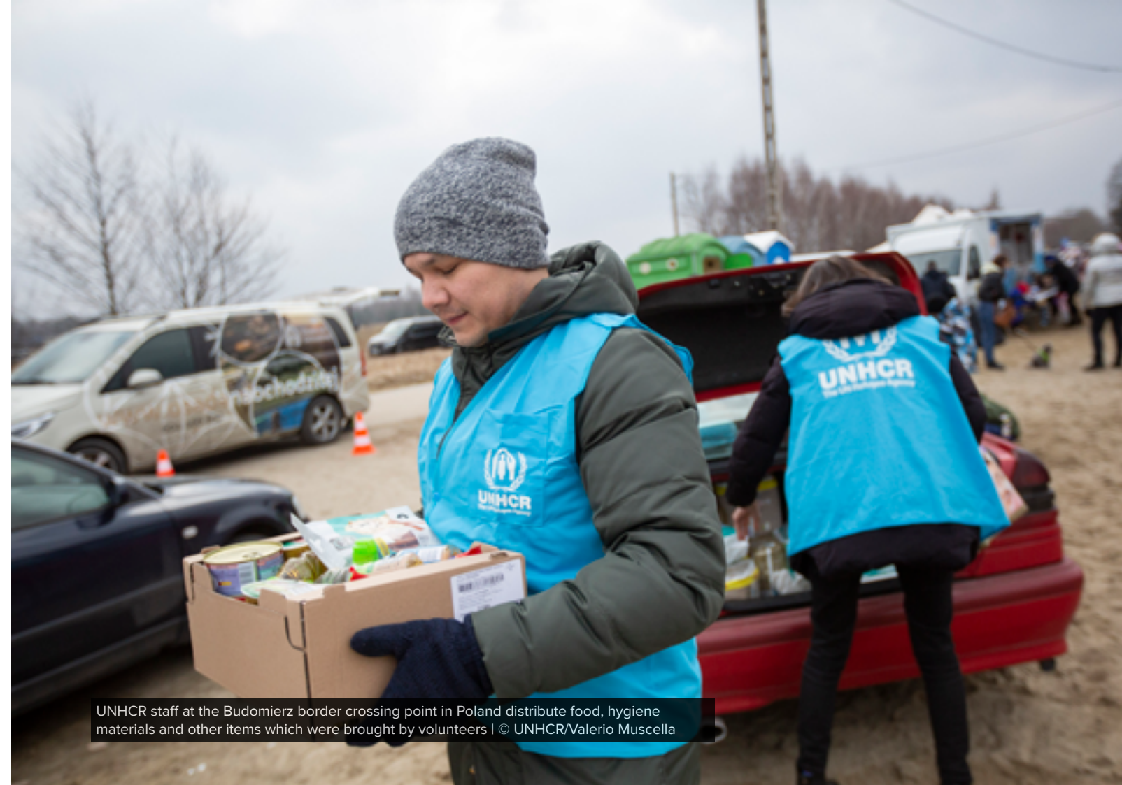
UNHCR staff at the Budomierz border crossing point in Poland distribute food, hygiene materials and other items which were brought by volunteers