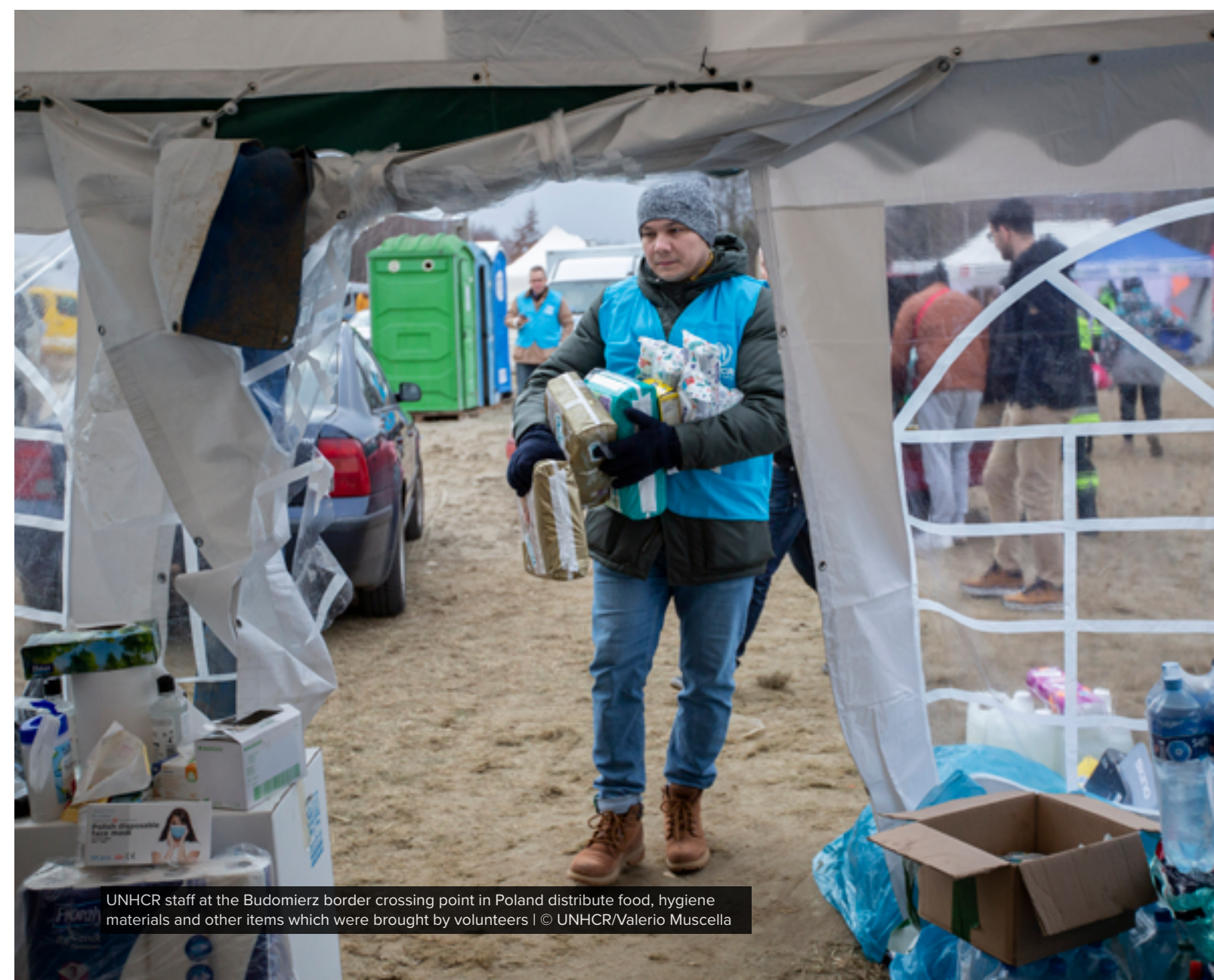
UNHCR staff at the Budomierz border crossing point in Poland distribute food, hygiene materials and other items which were brought by volunteers

In countries where it is required, UNHCR will provide emergency shelter and work with the authorities to establish temporary reception and/or transit facilities.