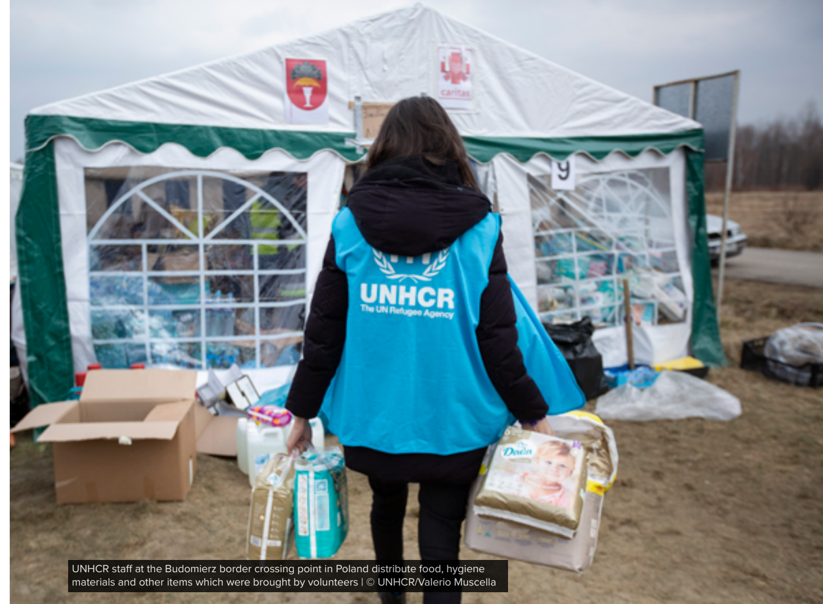
UNHCR staff at the Budomierz border crossing point in Poland distribute food, hygiene materials and other items which were brought by volunteers

The Global Focus situation page for the Ukraine Situation can be found here .