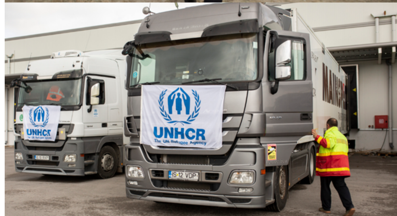
Trucks loaded with core relief items for the Ukraine emergency depart from UNHCR's warehouse in Athens heading for Moldova and Poland