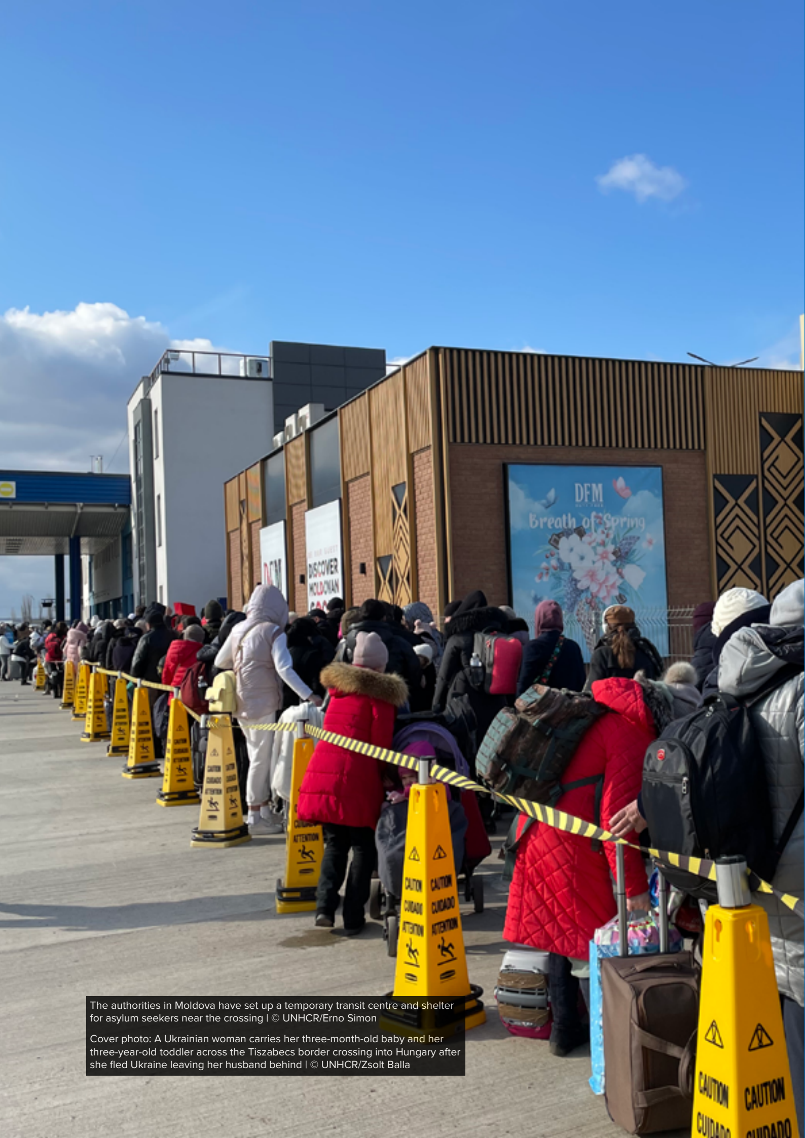
The authorities in Moldova have set up a temporary transit centre and shelter for asylum seekers near the crossing Cover photo: A Ukrainian woman carries her three-month-old baby and her three-year-old toddler across the Tisabecs border crossing into Hungary after she fled Ukraine leaving her husband behind