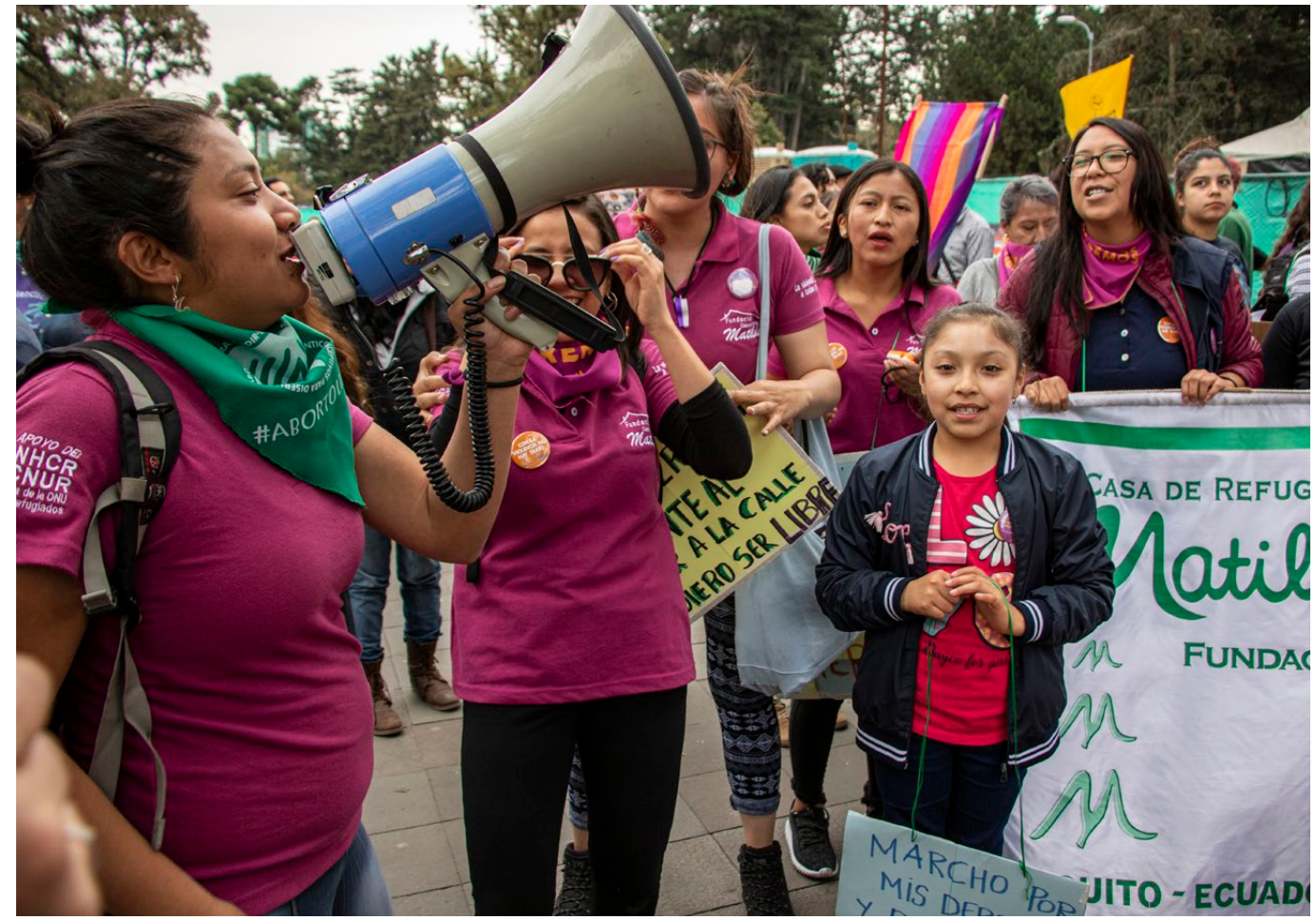
UNHCR's partner Fundación Casa de Refugio Matilde staff show their support for survivors of gender based violence at a march in Quito, Ecuado.

Over the coming five years, we will deliver specialized programming to strengthen prevention and response interventions and bolster integrated approaches across our areas of work, especially from the onset of emergencies. We will also reinforce our victim-centred approach towards eradicating sexual exploitation and abuse and sexual harassment, continuing to lead and contribute to coordinated initiatives in the broader humanitarian sector.