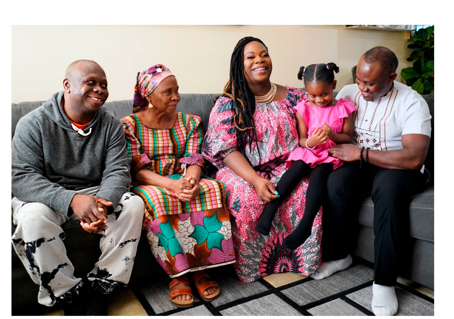
Liberian Gboeah-Flomo family gathers to celebrate Black History Month. They were resettled to Delaware, United States in 1992.

We recognize that solutions to problems of forced displacement and statelessness require addressing causes as well as consequences, and we will engage in comprehensive analysis and advocacy to guide early efforts to address drivers and triggers.