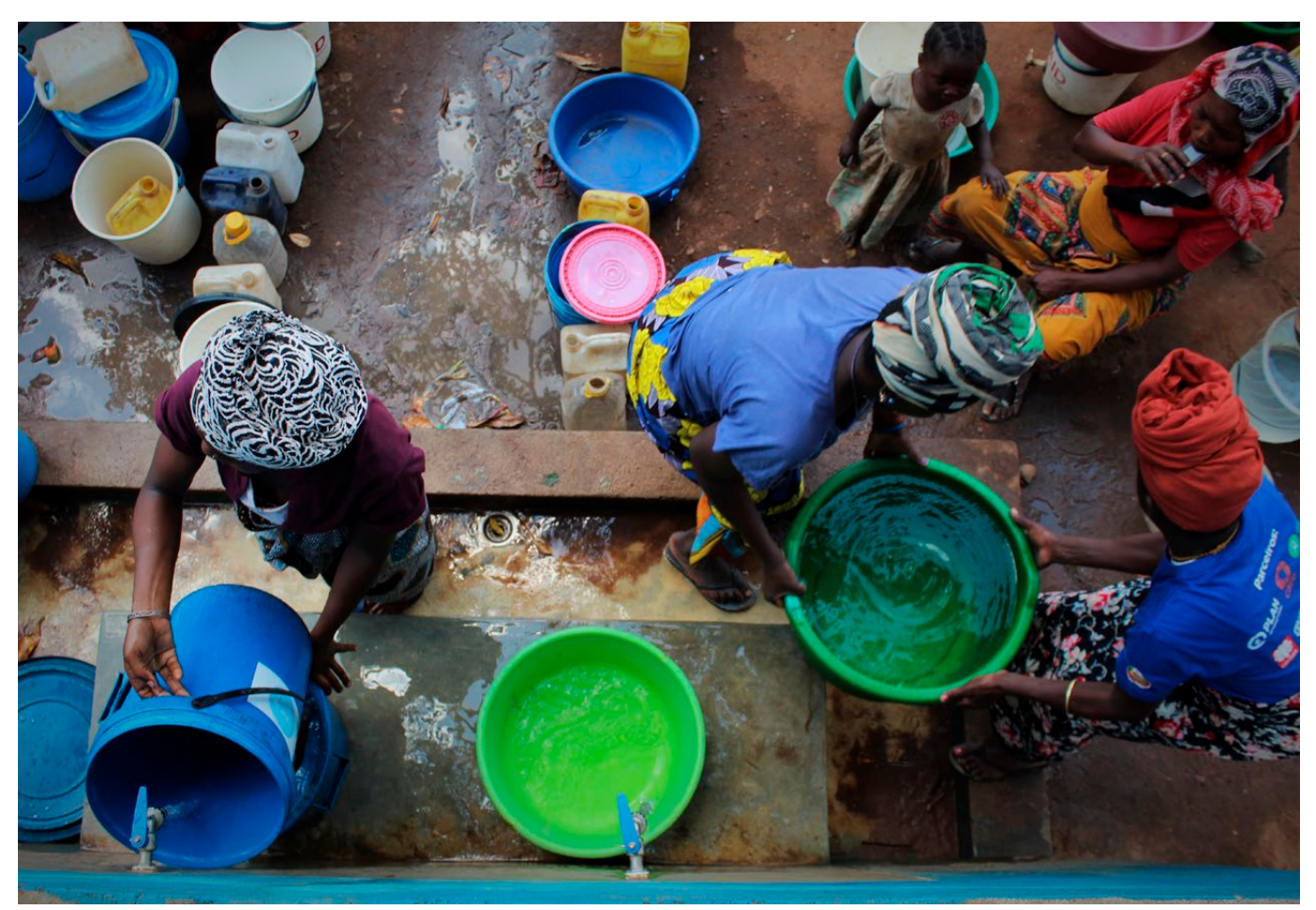
Internally displaced women collecting water in IDP site in Cabo Delgado, Mozambique.

collective response in support of States and affected populations.<sup>14</sup> We will also step up leadership and coordination of protection, shelter, and camp management in situations of internal displacement. Furthermore, we will catalyse and join stronger alliances among humanitarian, development and peace actors to promote solutions for IDPs and more effective support by the international community, in line with the recommendations of the Secretary-General's High-Level Panel on Internal Displacement.