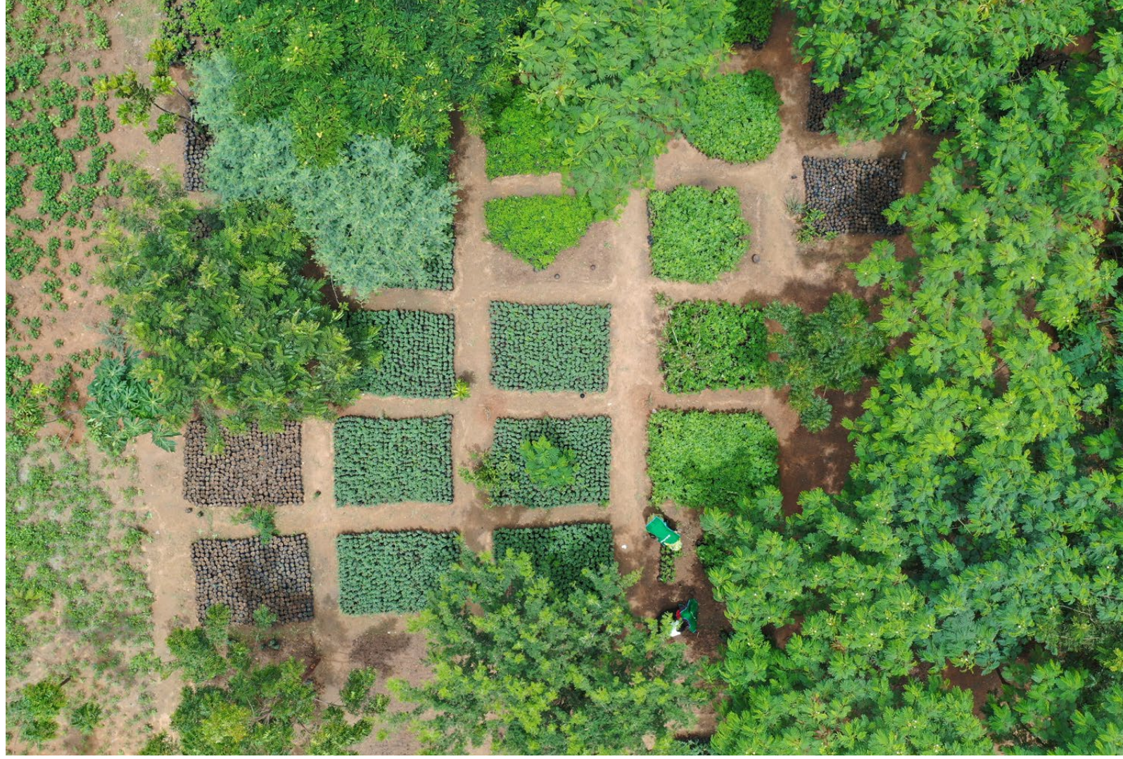
Reforestation project turns Minawao refugee camp in Cameroon green again