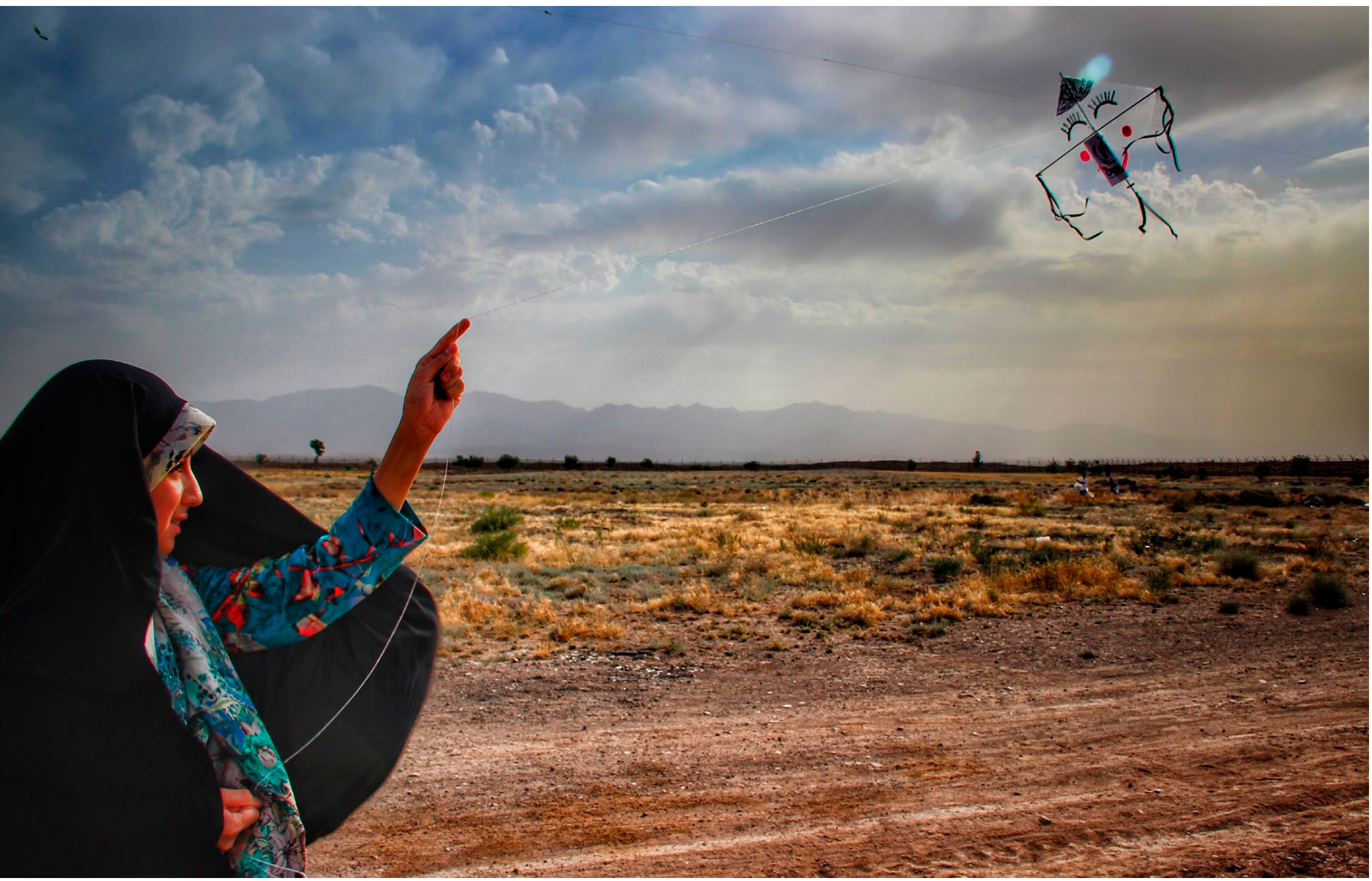
Afghan refugee girl flies a kite on World Refugee Day in Torbat e-Jam settlement, Iran