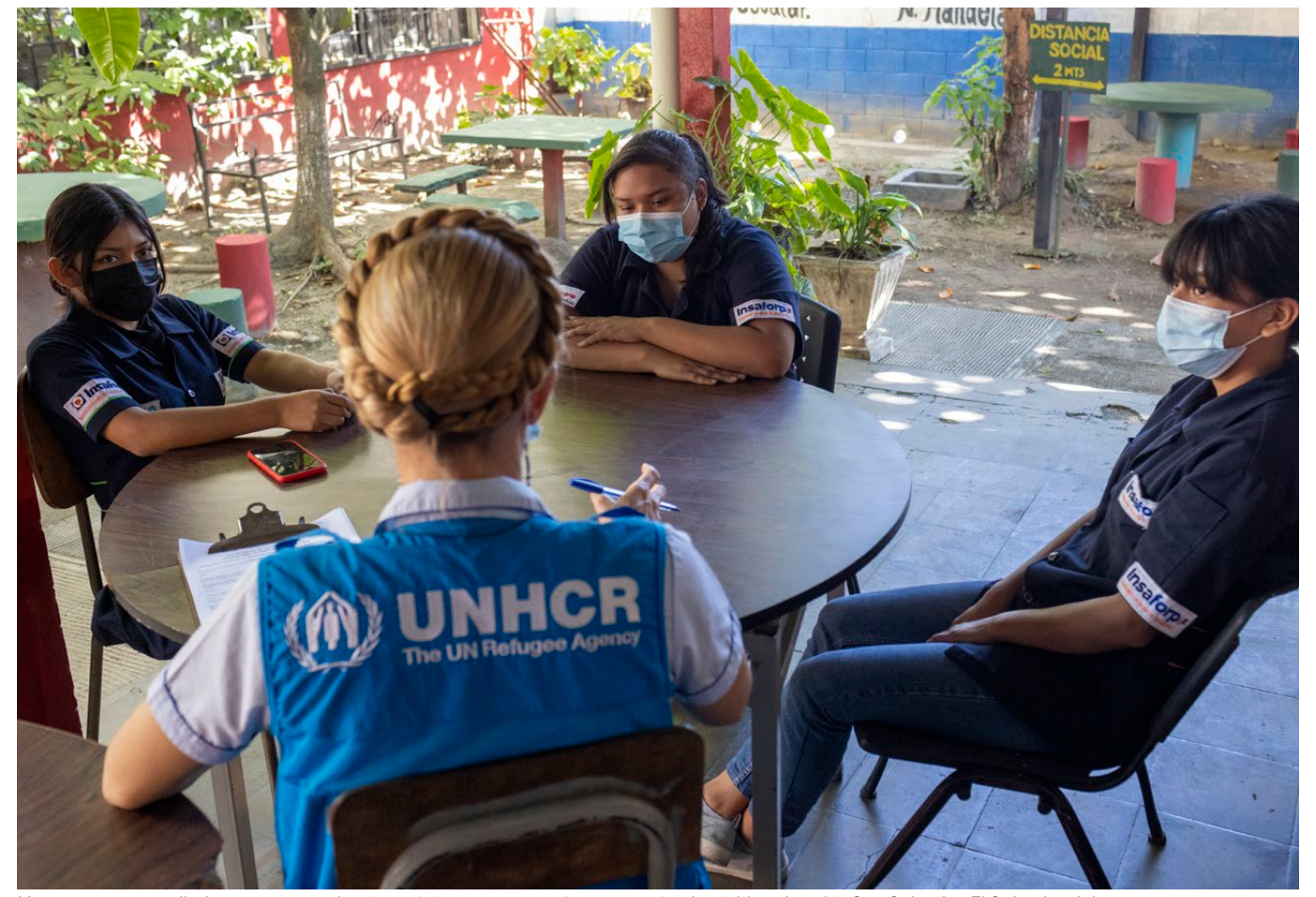
Young women enrolled in an auto mechanics training programme in a stigmatized neighbourhood in San Salvador, El Salvador. Job schemes help keep young people out of the clutches of gangs.

We will also support forcibly displaced and stateless people to contribute to the communities where they live and promote the use of modalities to support their inclusion and benefit local communities.