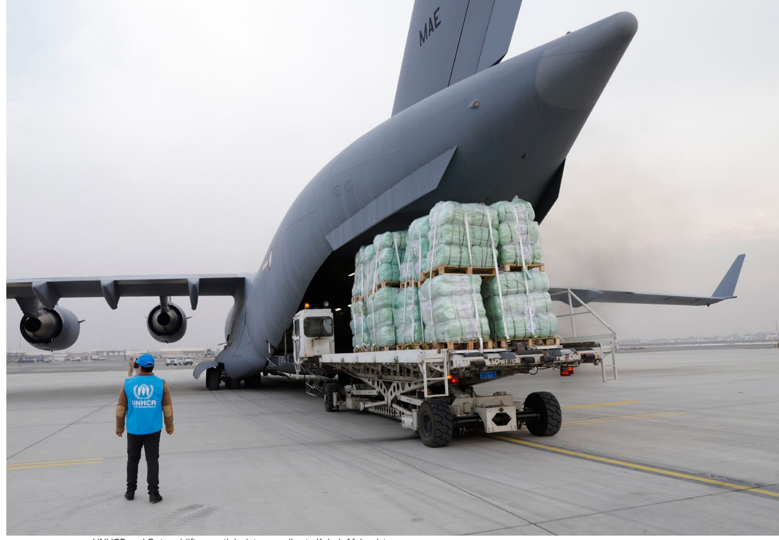
UNHCR and Qatar airlift essential winter supplies to Kabul, Afghanistan.