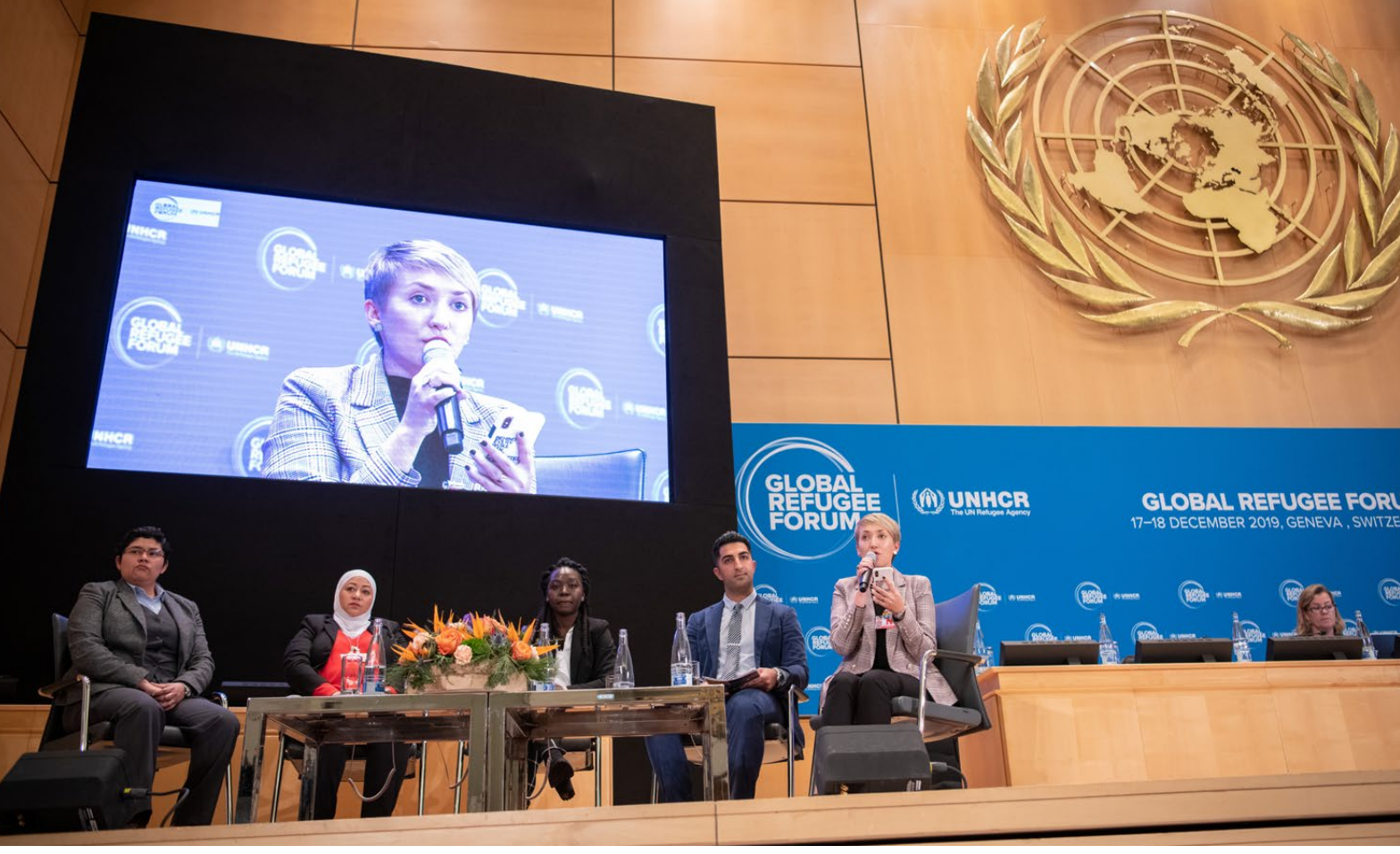
Refugee representatives issue a joint statement on the results of the Global Refugee Forum

Safeguarding international protection will demand enhanced efforts in the coming five years. We will work with States and our partners to build more adapted and sustainable asylum systems that can respond to the phenomenon of mixed movements, while ensuring that people on the move are able to exercise their rights in line with international standards. UNHCR will strongly advocate for meaningful responsibility-sharing arrangements to support hosting States, while simultaneously working to safeguard the right to seek asylum on all territories.