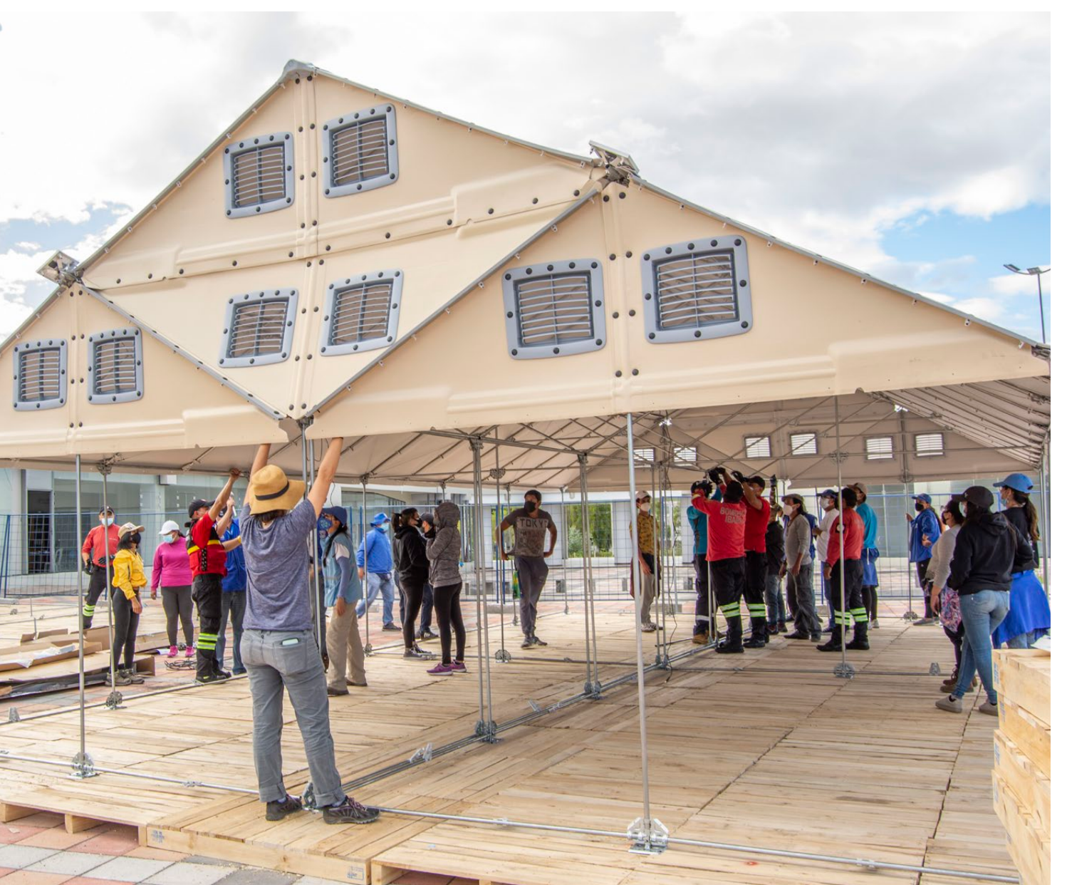
UNHCR, partners and youth volunteers build refugee housing units to expand a community diner in Ibarra, Ecuador.

Five years ago, we committed to making changes in systems, staffing, culture and ways of working to better assist and uphold the rights and dignity of the people we serve. In renewing these Strategic Directions, we recognize the significance of this transformation journey.