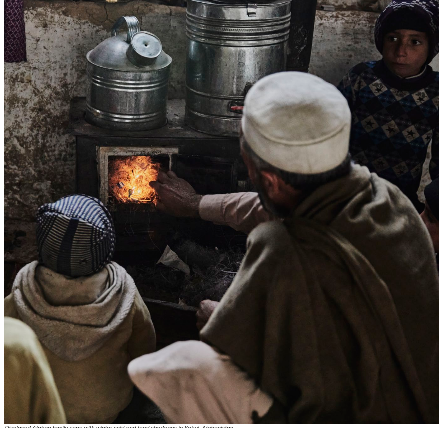
Displaced Afghan family cope with winter cold and food shortages in Kabul, Afghanistan