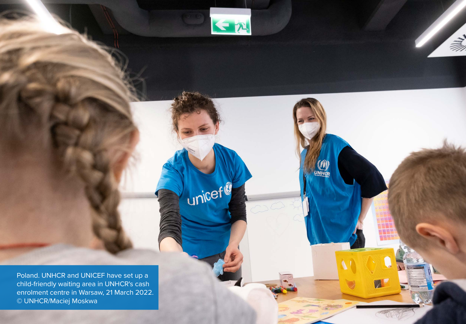
Poland. UNHCR and UNICEF have set up a child-friendly waiting area in UNHCR's cash enrolment centre in Warsaw, 21 March 2022.