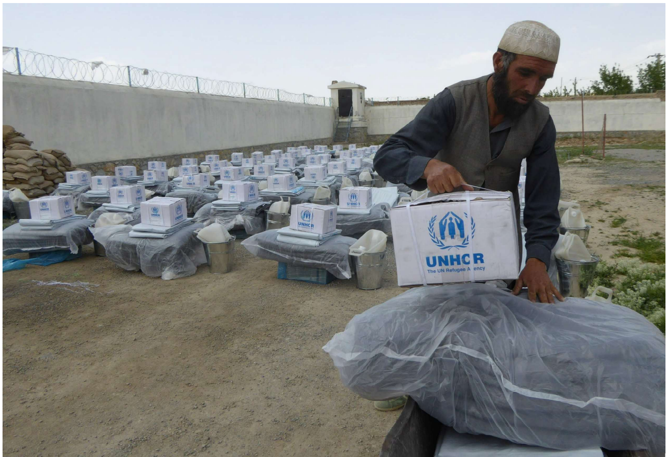
UNHCR in Kabul providing rent support and distributing cooking items, gas cylinders and other essential household items to internally displaced people.