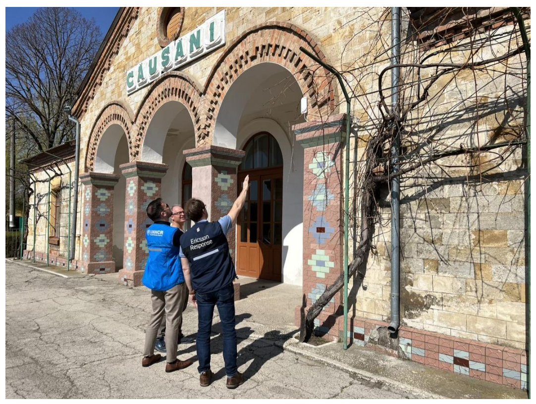
Ericsson Response and UNHCR conduct visit to Căuşeni Train Station, which has served as one of the main transportation hubs since the start of the Ukraine crisis. Connectivity is provided here to humanitarians and refugees thanks to the support of Cisco Crisis Response and Ericsson Response.