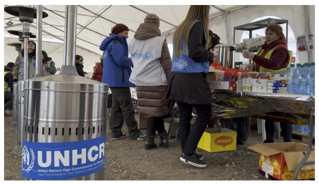
Humanitarian organizations assisting refugees in the Palanca Humanitarian Hub rely on Internet connectivity provided by the Refugee Emergency Telecommunications Sector.

The UNHCR-led Refugee Emergency Telecommunications Sector (RETS) is the coordinating body for IT and communications assessment and service delivery in refugee emergencies. RETS seeks to reinforce multi-sector coordination by streamlining IT and communications into operational preparedness and response strategies for the delivery of assistance to refugees and other persons of concern.