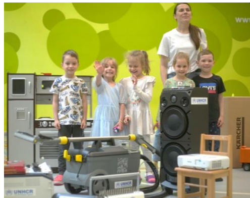
On 6 May, UNHCR provided equipment to a temporary kindergarten operated by NGO Yednist in Budapest, including printers, projectors, speakers and other supplies to help ensure a favorable learning environment for refugee children recently arriving from Ukraine.