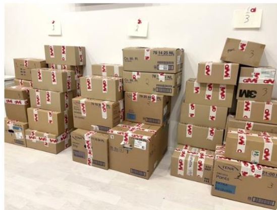
Between 1 March – 15 April 2022, AMI delivered over EUR 30,250 in medicine to benefit refugees arriving to Hungary, as well as those remaining in Ukraine.