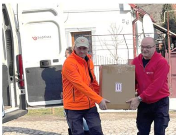
Hungarian Baptist Aid is working to meet the basic needs of refugees through provision of food items as well as core relief items and non-food items, in addition to shelter, health and integration support.