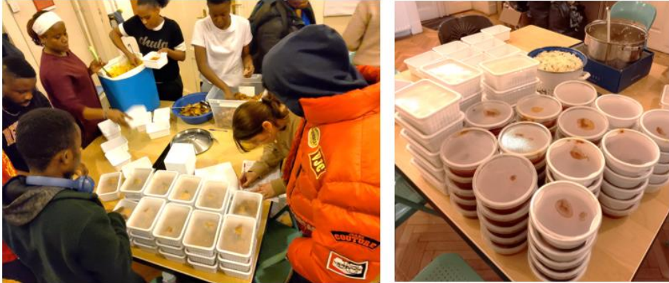
Next Step and their network of volunteers distribute warm meals and core relief items to refugees arriving from Ukraine to Hungary, including third country nationals.