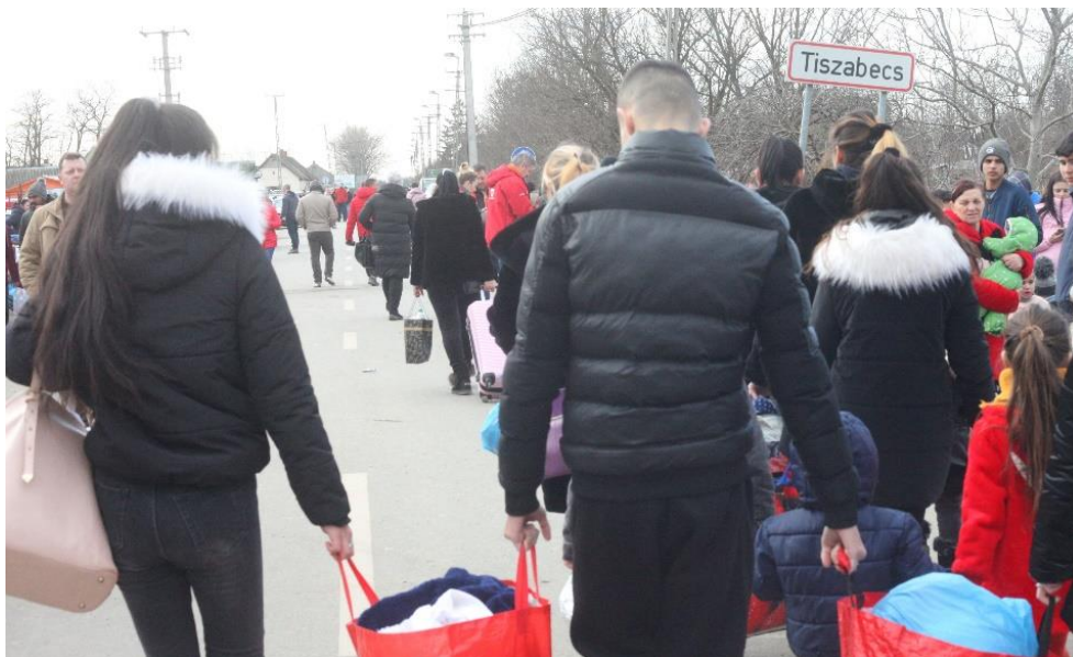
Refugees from Ukraine arrive to Hungary at Tiszabecs border crossing point in the east of the country. The majority of arrivals to Hungary are women and children, as well as older people and persons with disabilities. Many require MHPSS due to exposure to traumatic events and symptoms of distress associated with the effects of conflict, while others need urgent medical care and assessment, including persons with disabilities and those with underlying illnesses.

Despite the commitment by authorities to provide assistance to people fleeing the war in Ukraine, the unprecedented rate of arrival has strained available resources, making provision of information and identification of vulnerable profiles more challenging. With people arriving to Hungary through multiple points of entry, many do not pass help / information points at transit sites to receive information before settling in the community or moving onward. Further monitoring of arrivals as well as comprehensive screening is also needed, particularly for persons with specific protection needs including those with disabilities , as well as cases involving unaccompanied and separated children (UASC) . The threat of trafficking and exploitation remains high particularly in border areas, which require strengthened government systems for trafficking prevention . Additional interpretation services are also needed to ensure that new arrivals remain fully informed about the possibility of applying for temporary protection.