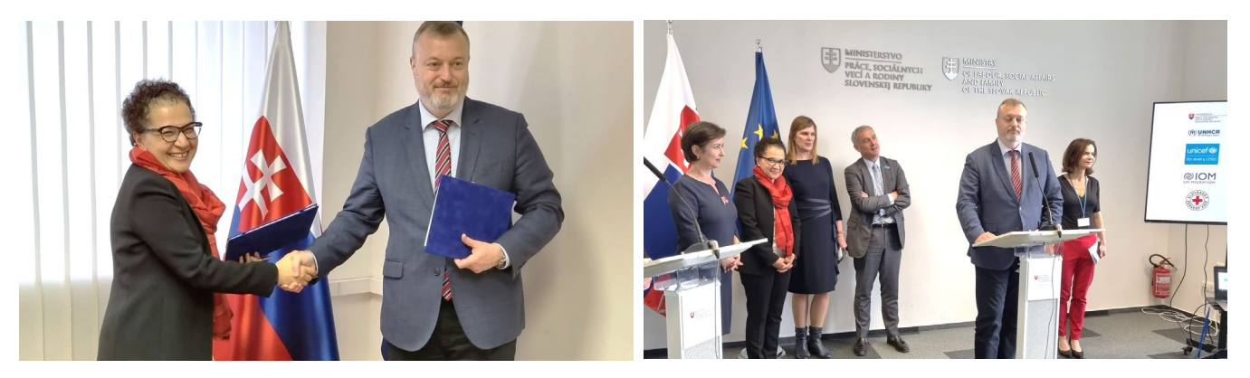
UNHCR's Senior Emergency Coordinator, Seda Kuzucu, greets Slovakia's Minister of Labour, Social Affairs and Family, Milan Krajniak, following the formal signing ceremony for coordinated cash programming for Ukrainian refugees in Slovakia on 27 April 2022. The ceremony was followed by a press conference attended by officials from the Ministry as well as humanitarian partners including UNICEF, IOM and the Slovak Red Cross.

UNHCR and partners are preparing to support the Government of Slovakia in the delivery of unrestricted cash assistance , to be implemented for vulnerable groups and individuals with specific needs as a means of improving access to basic goods and services, while reducing the risk of resorting to harmful coping mechanisms. On 27 April, a press conference took place in Bratislava to formally launch interagency coordinated cash programming for Ukrainian refuees in Slovakia, followed by the signing of a memorandum of understanding between the Ministry of Labour, Social Affairs and Family of the Slovak Republic, UNHCR and other humanitarian agencies (UNICEF, IOM, Slovak Red Cross).