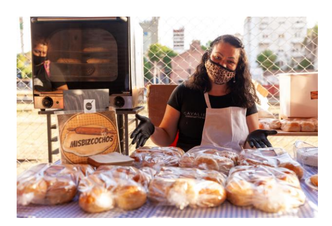
Argentina. A Venezuelan entrepreneur showcases her Venezuelan sweet bread initiative. Her enterprise is called Mis Bizcochos and is one of the 32 initiatives that participated in the "Festival del Reencuentro".

The Inter-Agency Coordination Platform (R4V) and the State-led Quito Process remain key regional mechanisms for harmonizing policies and practices, scaling up and coordinating the humanitarian response and improving access to basic rights. In Venezuela, UNHCR operates within an interagency framework to assist the most vulnerable population groups inside the country, including recent returnees.