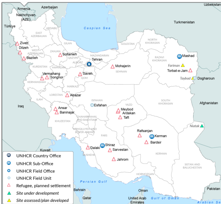
The boundaries and names shown on this map do not imply official endorsement or acceptance by the United Nations.