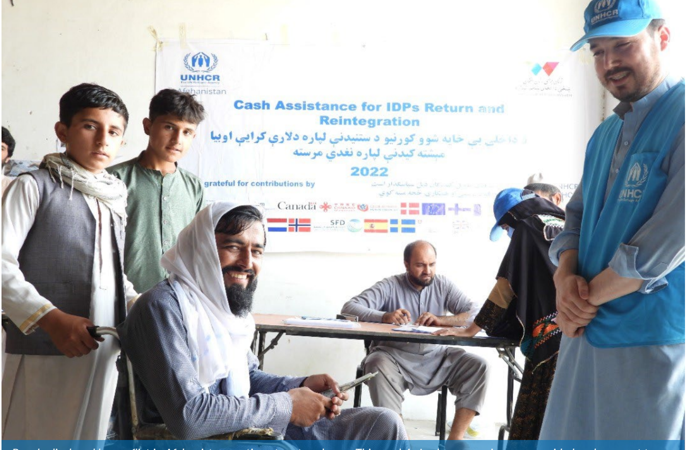
People displaced by conflict in Afghanistan continue to return home. This week in Laghman province we provided cash support to 2,700 formerly displaced persons to help them meet basic needs.