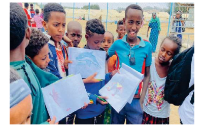
UNHCR and partner IHS providing recreational activities to about 1,000 children in the Kulichmeda site Child Friendly space. Dabat. Amhara.