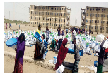
UNHCR and partner ANE distributing core relief items to more than 15,000 displaced persons and returnees in Dubti and Berhale. Dubti, Afar. @UNHCR/June 2022