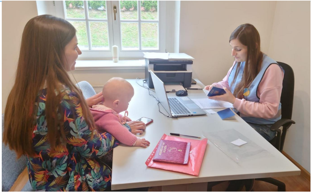
Refugees from Ukraine – mostly women and children– are enrolled to receive cash assistance at the newly established cash enrollment centre in Bytom, Poland. © UNHCR/ Wisdom Enalebor, 08 June 2022

FILIPPO GRANDI United Nations High Commissioner for Refugees