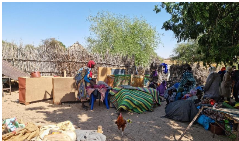
Residents of Goz Minu and Um Sayyala in the Jebel Moon area were displaced to the Johana area after their villages were burned down during intercommunal violence that broke out in the mountainous Jebel Moon region of West Darfur. The clashes have displaced thousands of people since November.

Over the course of 2021, the protection environment in Sudan faced several challenges and impacts were felt into 2022. The withdrawal of UNAMID in Darfur was followed by an increase in localized and cyclical conflict, with violence in Darfur increasing to levels unseen since the mid-2000s. There is also an increase in violence in the South Kordofan and, to some extent, in the Blue Nile State. The military coup d'état essentially put in limbo both the Juba Peace Agreement (JPA) and the National Plan for the Protection of Civilians (NPPOC). The state of emergency was lifted on 29 May 2022 but the impact of this is yet to be seen.