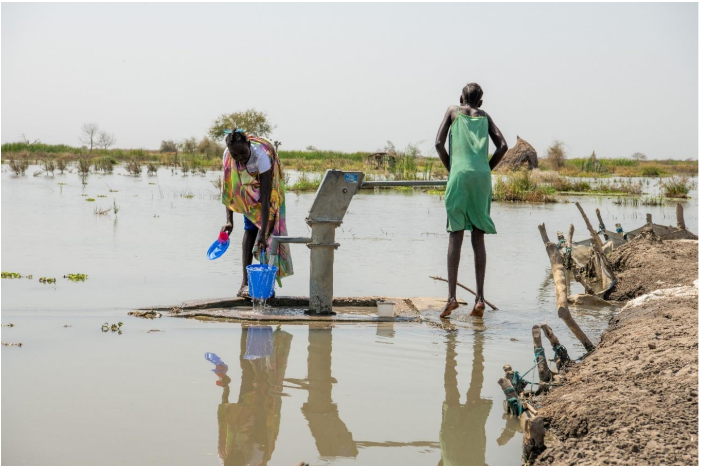
Children pump clean drinking water from a partially submerged borehole in Old Fangak, South Sudan. While the wetland region has always been prone to heavy rains and flooding, residents say the patterns shifted sharply four years ago.