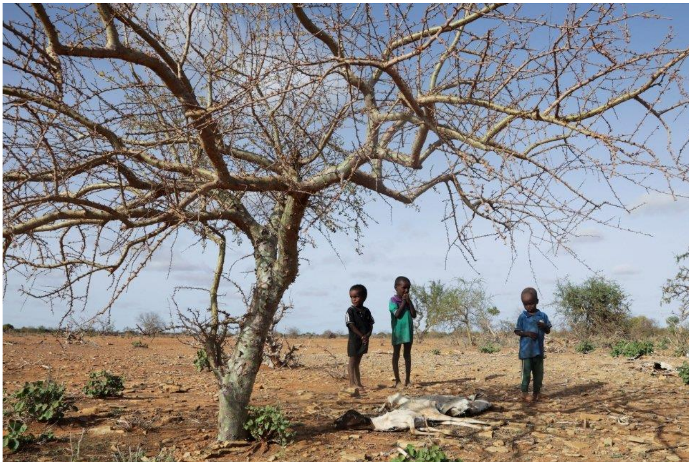
Internally displaced Somali children Ali Abdulahi, Osman Abdulahi and Mohamed Abdulahi stand near the carcass of their dead livestock following severe droughts near Dollow, Gedo Region, Somalia.