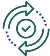
Updates & Achievements

WHO, UNHCR, UNICEF, UNFPA, IOM, HI, French Red Cross, IRC, AFI, TdH, UNAIDS, IsraAID, Project Hope