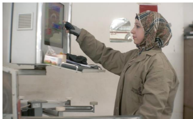
Caption: SES participant during the CNC operator in the province of Hatay.