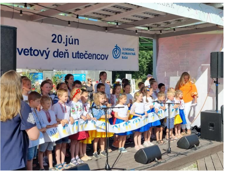
Children at the World Refugee Day event in Bratislava.