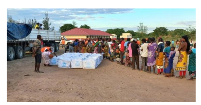
Families queuing to receive CRIs in Zambezia Province.

another site who had previously received partial kits, received additional items to top up the kits, amounting to 564 blankets, 369 sleeping mats, 2,478 mosquito nets, 1,238 kitchen sets and 1,243 solar lamps.