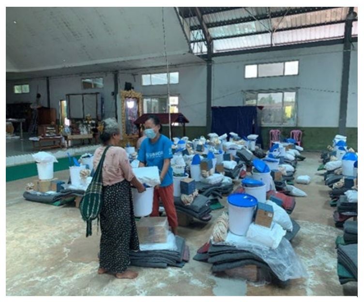
A displaced woman receiving relief items in Kayin State

and Kayah States. In response to several landmine related incidents in Kayah State, UNHCR, in collaboration with UNICEF, distributed 750 mine risk education leaflets to IDP.