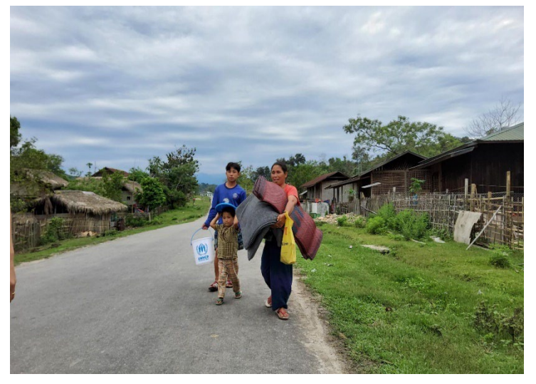
UNHCR and its partners are providing relief items to IDPs in Kachin State