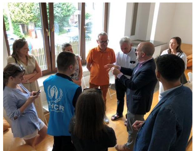
UNHCR Representative meets with staff from Volunteer Centre in Lublin, in a house hosting four families who fled Ukraine. Local organizations are frontline responders.

UNHCR has boosted its presence and response to provide life-saving cash assistance, protection, and other support in line with Government-led efforts.