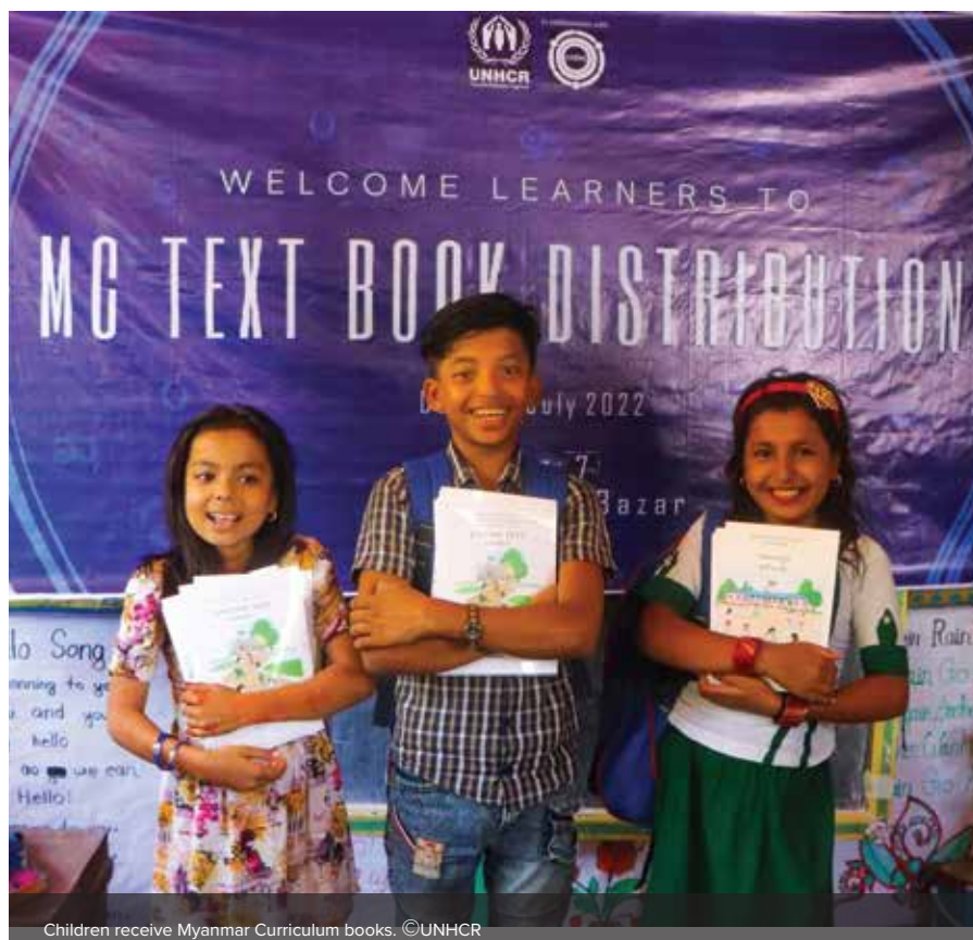
Children receive Myanmar Curriculum books.

Adolescents and youth participated in basic numeracy, literacy and life skills courses