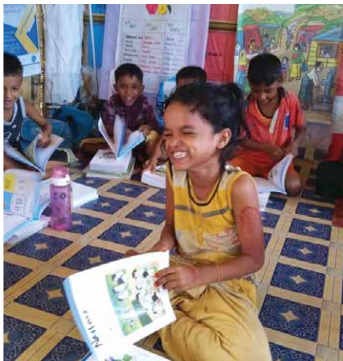
Happy Children with new Myanmar Curriculum books in the classroom.

UNHCR in collaboration with its partners formed Community Education Committees to support children and parents. These groups facilitate awareness sessions on education, visit families to provide guidance to caregivers and monitor caregiver-led education activities during COVID-19 lockdowns. They also help ensure that children and youth have access to learning centres, materials, and other informal learning activities.