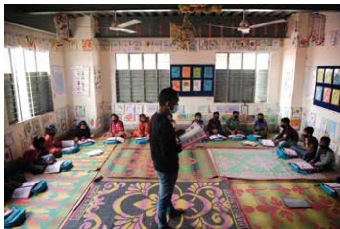
Children attend school on Bhasan Char, where they follow the Myanmar Curriculum.