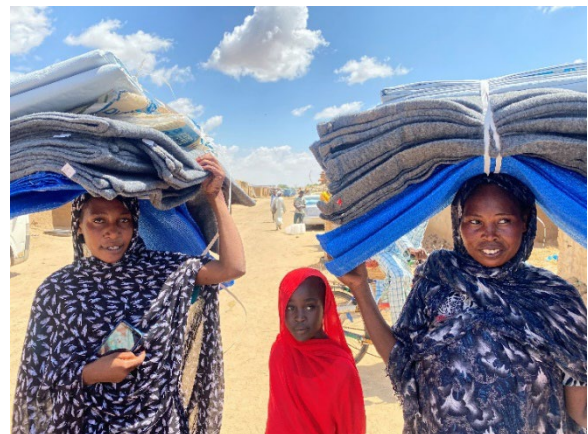
Distribution of materials in Abu Shouk IDP Camp to 65 families affected by heavy rains

The need for plastic sheets & other non-food items to assist affected families is dire across all five Darfur states. As the Shelter/NFIs cluster lead, UNHCR is coordinating with agencies to distribute available stocks to affected families. Current prepositioned kits can only cater for half the affected population.