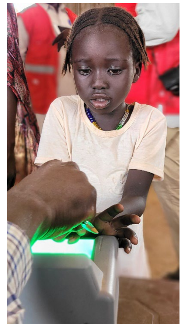
Refugee registration on East Darfur

Access to health services continued in all states except in North Darfur where Ministry of Health (MoH) staff went on strike complaining of low salaries. In August, UNHCR supported MoH with medical equipment to improve health care access & allocated money for incentive worker payments. However, the continuing lack of medicine and trained personnel is affecting refugees access to healthcare. The rainy season has