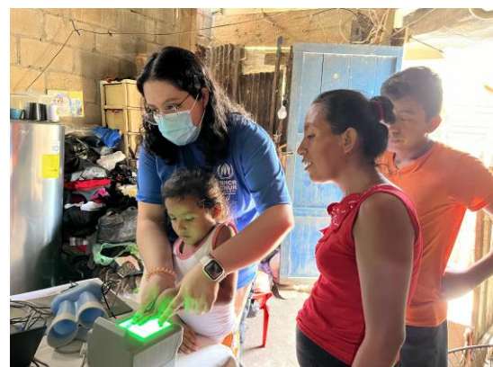
Home visits and biometric measurements in Catarina, San Marcos.