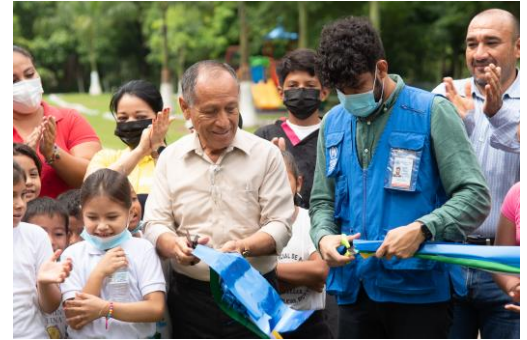
Inauguration of Ayutla Explorer, an ecological park in Ayutla, San Marcos.