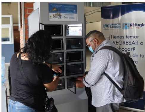
Phone charging station at the Center for Returnees in Tecun Uman.