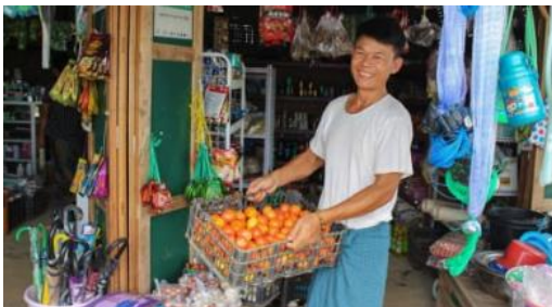
[ STORY ] Going local: A fresh start for displaced communities in Myanmar