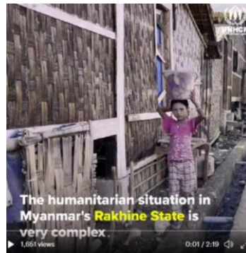
[ VIDEO ] Humanitarian situation in Rakhine State