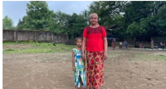
[ STORY ] Stateless Rohingya continue to struggle for survival in Myanmar