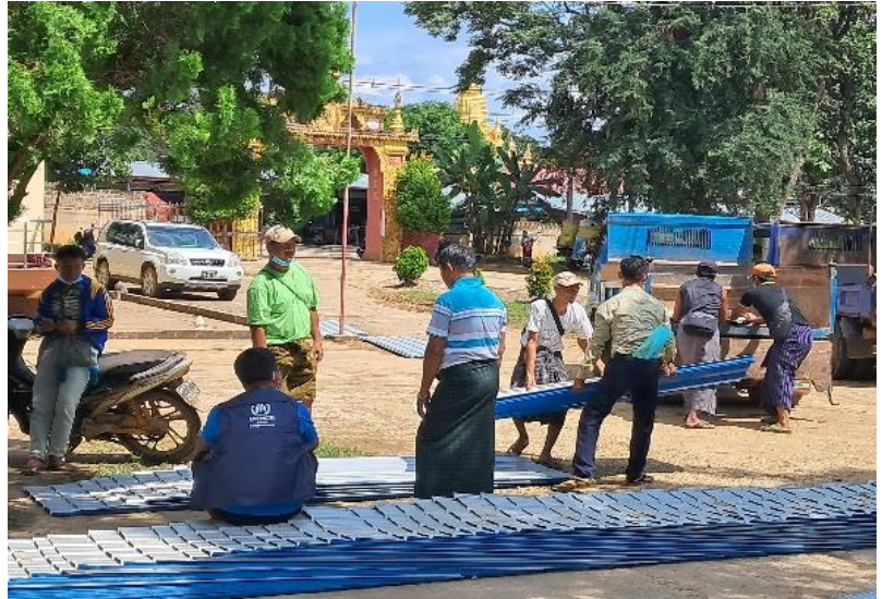
UNHCR and partners distributing shelter materials to IDP in Kayah State