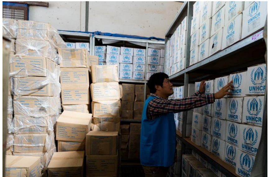
UNHCR staff pre-positioning relief items in a warehouse in Shan (North) State