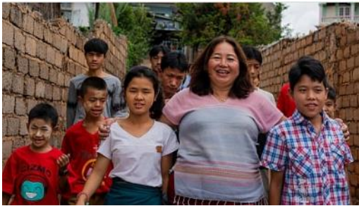
[ STORY ] Civil society group hailed for supporting displaced people in remote parts of Myanmar