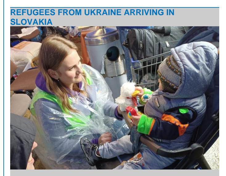
In this video, Ukrainian refugees arrive to Slovakia, where they are welcomed by UNHCR and partners. They share their uncertainty about what their future holds, but also their hope.

Various favorable legislative changes have been adopted such as the Lex Ukraine 3 package which, among other components, regulates data sharing with international organizations to facilitate the provision of assistance to those most in need. Such data sharing is of particular importance for the cash-based intervention (CBI) programme.