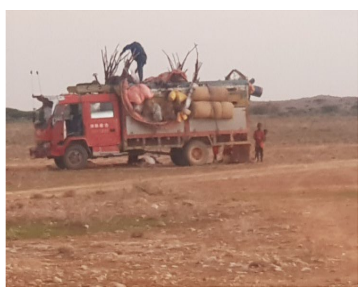
Displaced Pastoralists with rented trucks in the surroundings of Las-Anod district

The PRMN is a UNHCR-led project which identifies and reports on displacements as well as protection risks and incidents underlying such population movements. On behalf of UNHCR and the Norwegian Refugee Council (NRC), 38 local partners in the field in Somalia (South Central regions, Puntland and Somaliland) undertake data gathering (primarily through interviews with affected communities and key informants) and monitoring at strategic locations.