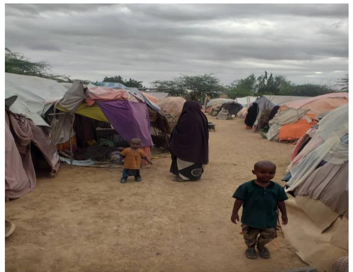
Figure 2: Newly constructed IDP sites in Belet Weyne

The PRMN is a UNHCR-led project which identifies and reports on displacements as well as protection risks and incidents underlying such population movements. On behalf of UNHCR and the Norwegian Refugee Council (NRC), 38 local partners in the field in Somalia (South Central regions, Puntland and Somaliland) undertake data gathering (primarily through interviews with affected communities and key informants) and monitoring at strategic locations.