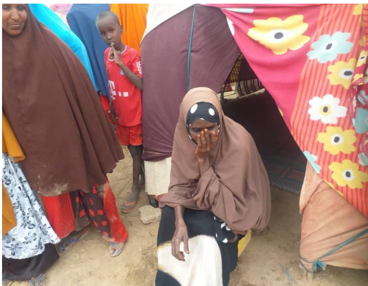
Figure 1: Newly arrived IDPs joined existing IDP sites in Belet Weyne