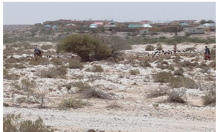
Figure 2: New displaced families with their animals

The PRMN is a UNHCR-led project which identifies and reports on displacements as well as protection risks and incidents underlying such population movements. On behalf of UNHCR and the Norwegian Refugee Council (NRC), 38 local partners in the field in Somalia (South Central regions, Puntland and Somaliland) undertake data gathering (primarily through interviews with affected communities and key informants) and monitoring at strategic locations.