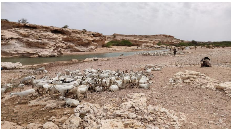
Figure 1: Newly arrived families fetching water with their animals in Iskushuban