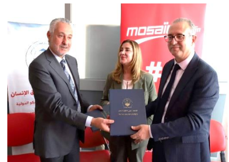
UNHCR, AIHR, and Mosaïque FM representatives signed a partnership agreement in Mosaïque's office.

UNHCR Tunisia is grateful for the support of: Austria | France | Monaco | Netherlands | RDPP NA – EU | Switzerland | The Mohammed bin Rashid Al Maktoum Global Initiatives | United States of America and those who have contributed to UNHCR with unearmarked and softly earmarked funding: Austria | Australia | Belgium | Denmark | France | Germany | Ireland | Italy | Japan | Netherlands | Norway | Spain | Sweden | Switzerland | United Kingdom | other private donors.